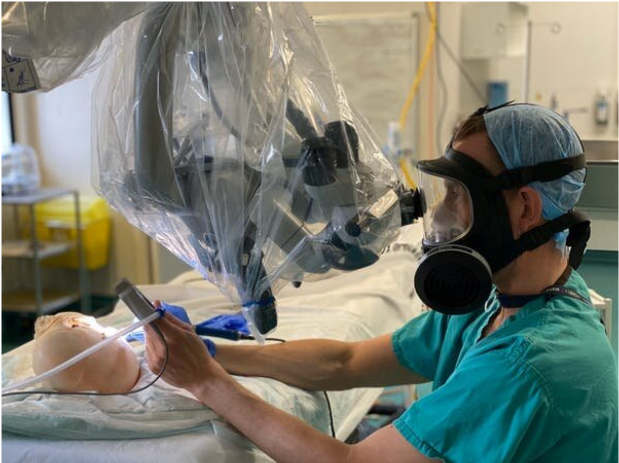
The full-face respirator approach.

Several medical procedures have been classed as " aerosol generating ", including cochlear implant surgery, which involves drilling into the bone behind the ear to access the middle ear. The high-speed drill we use during surgery can spread droplet and aerosol contamination throughout a confined theater space. These droplets and aerosols will contain a mixture of water, bone, blood, tissue and, potentially, viable viruses.