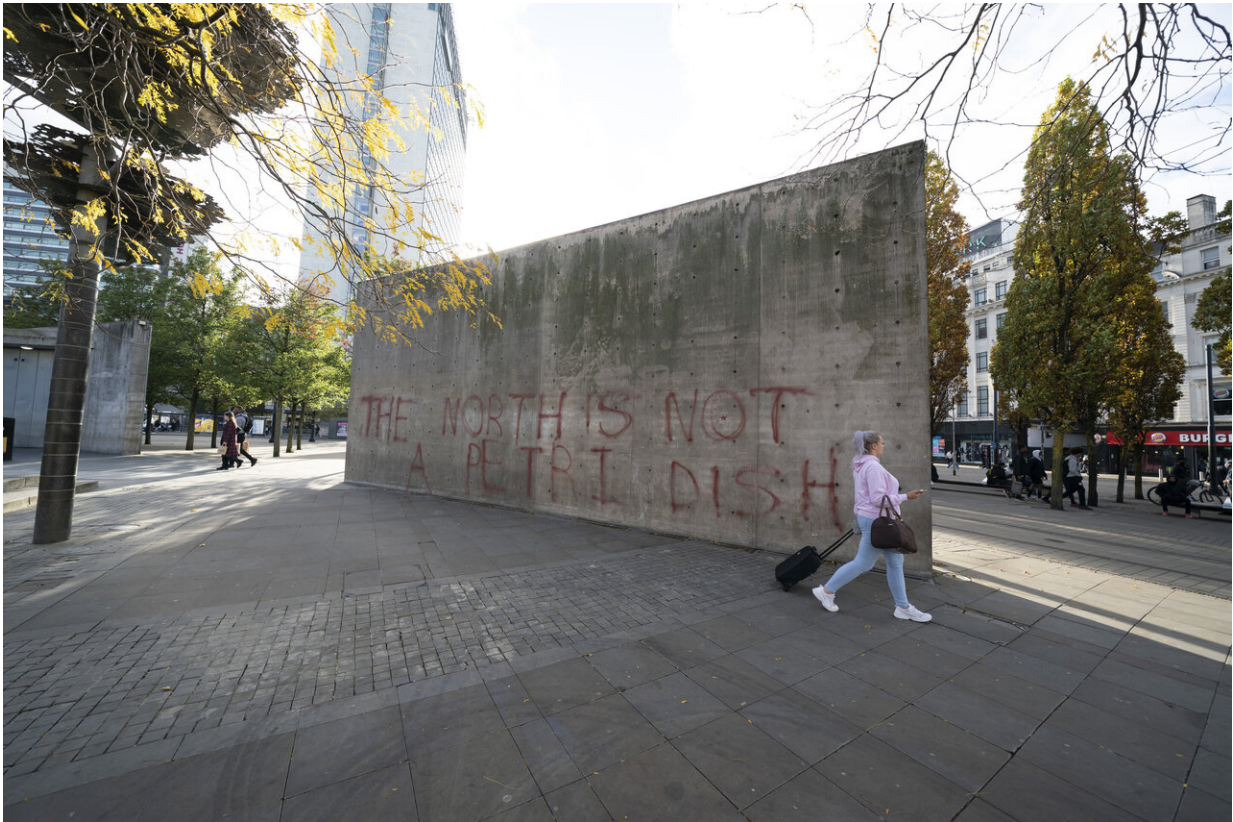
A woman walks by coronavirus related graffiti on a wall, in Manchester, England, Tuesday, Oct. 20, 2020. The British government appeared poised Tuesday to impose strict coronavirus restrictions on England's second-largest city after talks with officials in Greater Manchester failed to reach an agreement on financial support for people whose livelihoods will be hit by the new measures