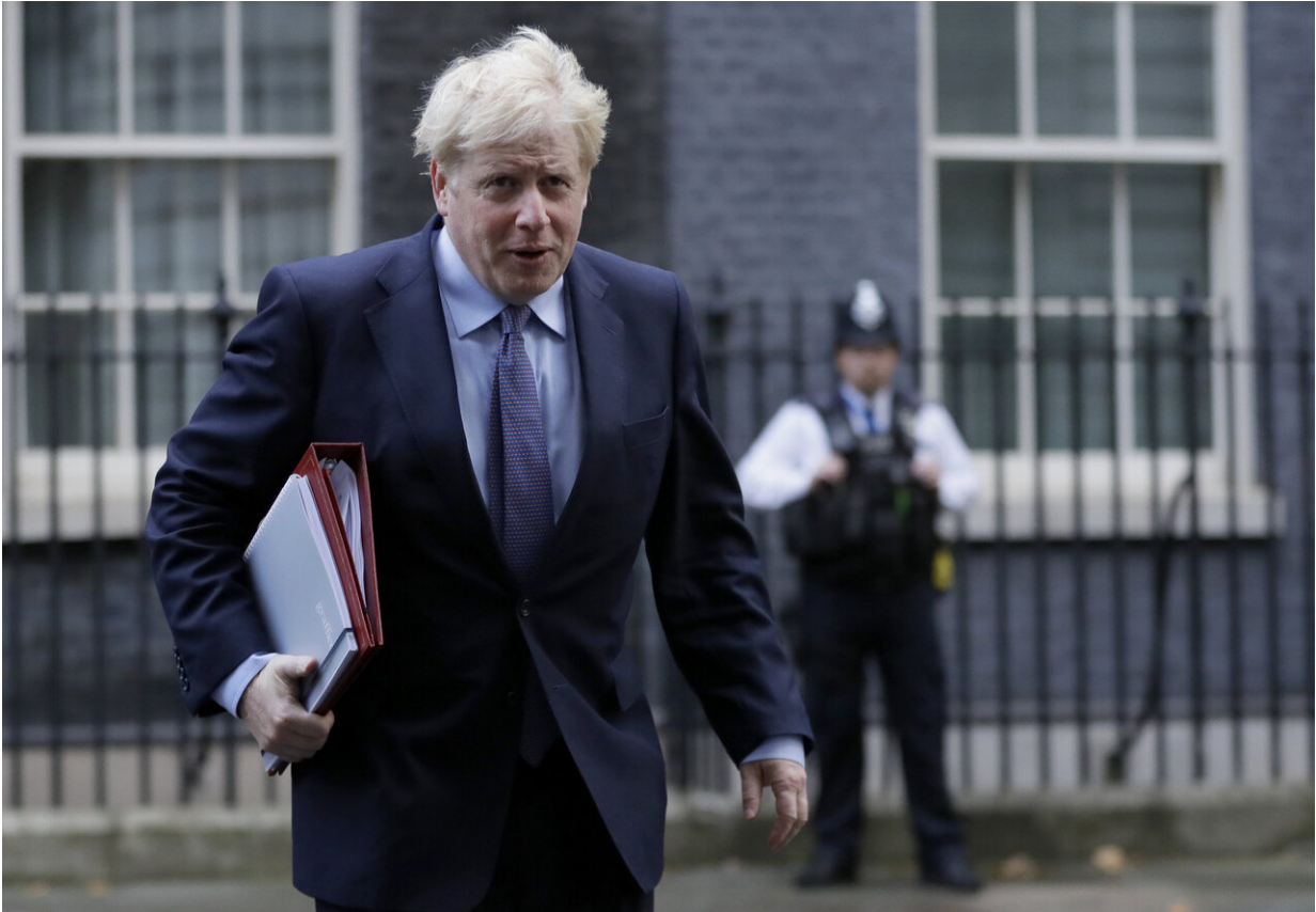
Britain's Prime Minister Boris Johnson walks across Downing Street to attend a Cabinet meeting in London, Tuesday, Oct. 20, 2020.