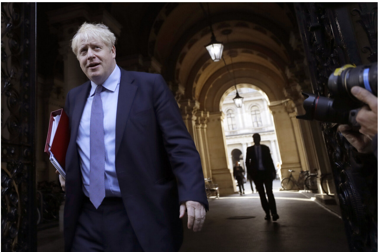
Britain's Prime Minister Boris Johnson returns to Downing Street after attending a Cabinet meeting in London, Tuesday, Oct. 20, 2020.

"It cannot be right to close people's place of work, to shut somebody's business, without giving them proper support," he told reporters. "It's brutal to be honest, isn't it. This is no way to run the country in a national crisis."