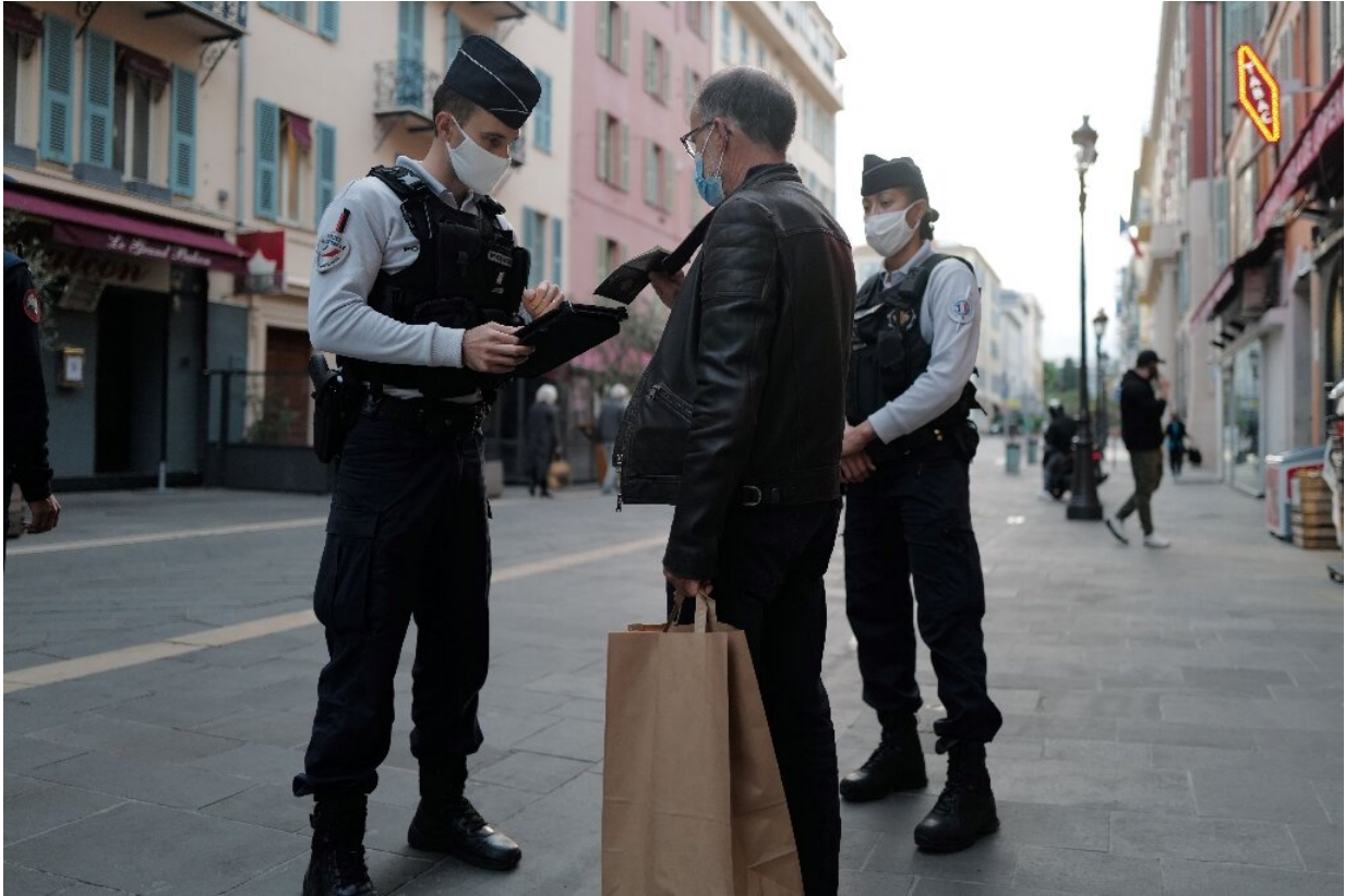
French police officers control passersby in Nice, during the country's second lockdown aimed at containing the spread of covid-19