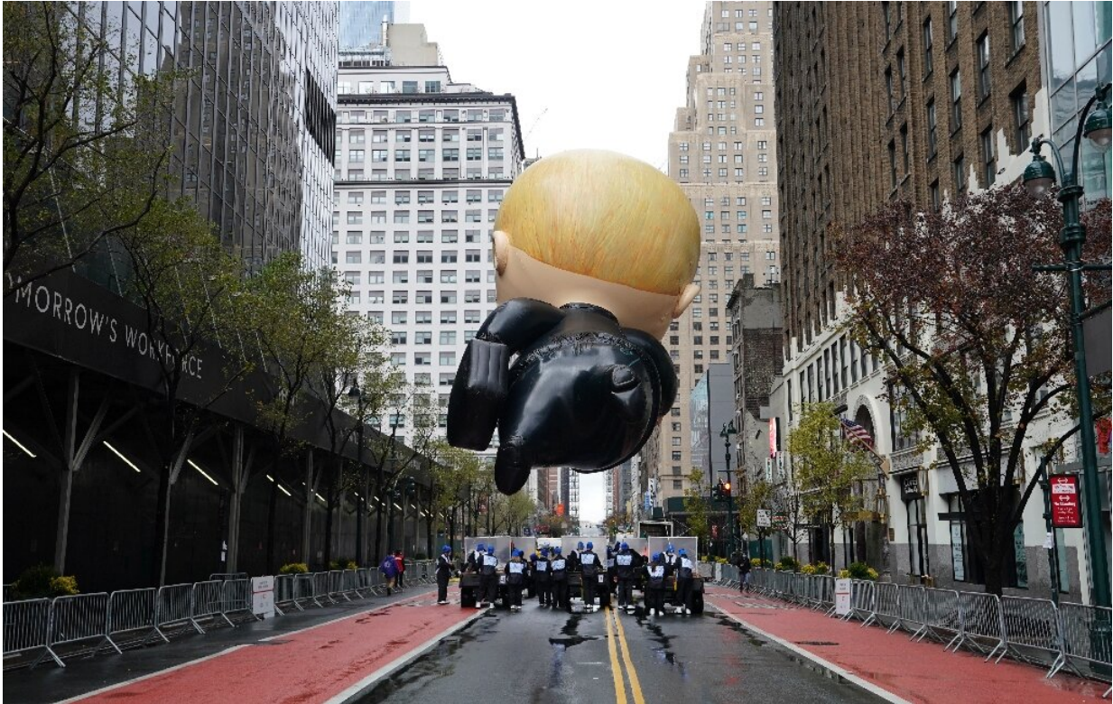
The "Boss Baby" balloon floats during an uncharacteristically subdued Macy's Thanksgiving Day Parade in New York on November 26, 2020