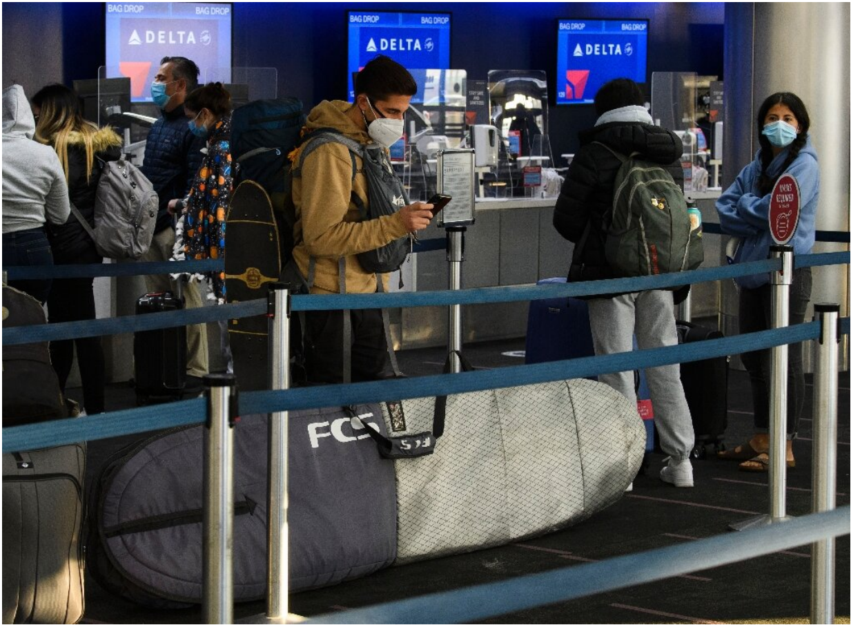
Passengers wait in line to check-in for Delta Air Lines flights at Los Angeles International Airport ahead of the Thanksgiving holiday in Los Angeles, California, on November 25, 2020