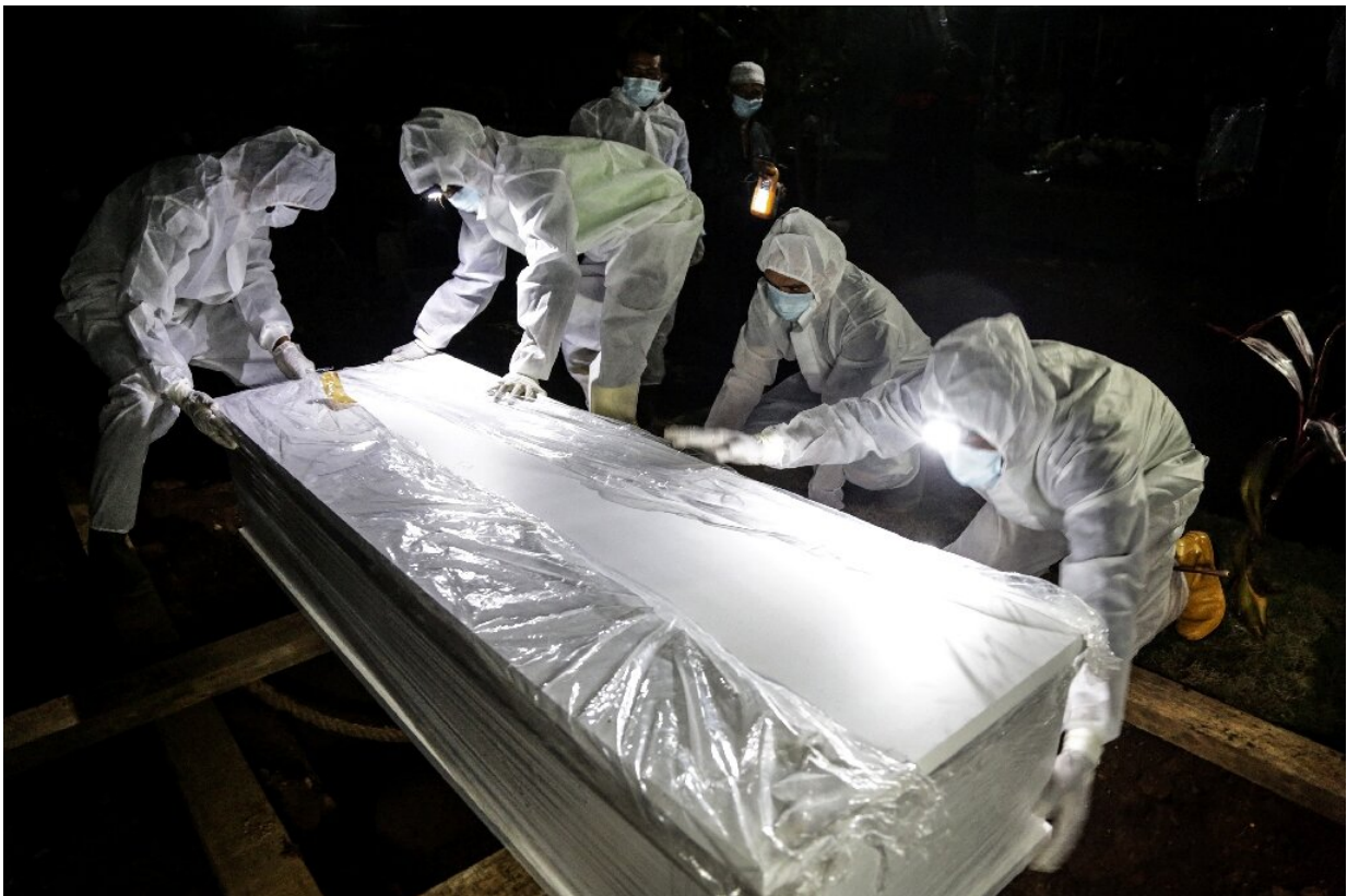
Graveyard workers in full protective gear move a coffin in Bogor, Indonesia

- Vaccine hopes—China has been giving experimental COVID-19 vaccines to people including state employees, international students and essential workers heading abroad since July.