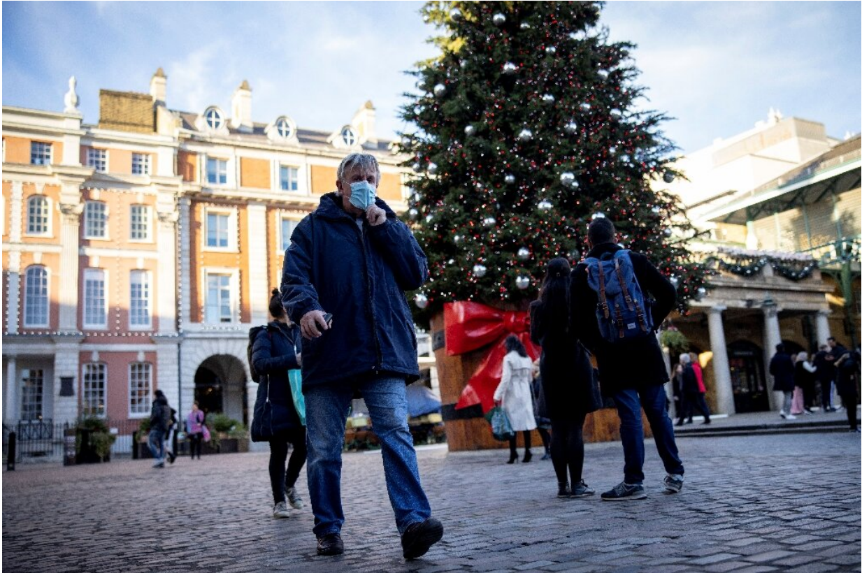
Pedestrians in face masks walk past a Christmas tree in London's Covent Garden

With more than 12 million cases and 255,000 deaths nationwide, many Americans were nonetheless heading to airports to travel for this week's Thanksgiving holiday.