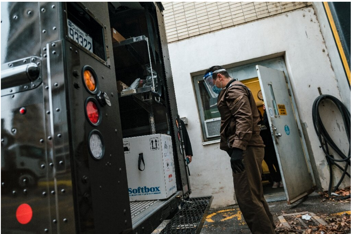
A UPS employee looks at a box with some of Canada's first Covid-19 vaccines in Montreal, Quebec on December 14, 2020

An initial 2.9 million doses are set to be delivered to 636 sites around the country by Wednesday, with officials saying 20 million Americans could receive the two-shot regimen by year end, and 100 million by March.