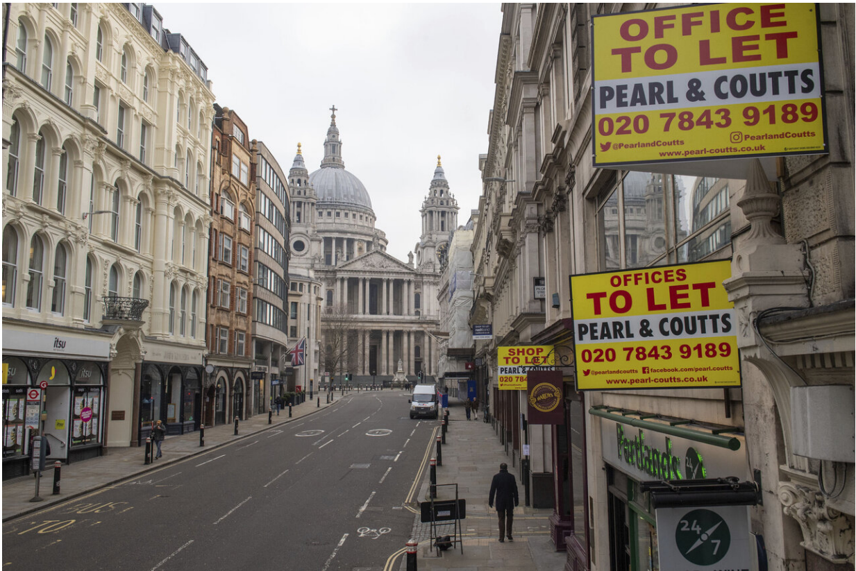
Office vacancy signs on a building, near St Paul's Cathedral during England's third national lockdown to curb the spread of coronavirus, in London, Friday, Jan. 8, 2021.

January 8 2021, by Danica Kirka and Jill Lawless