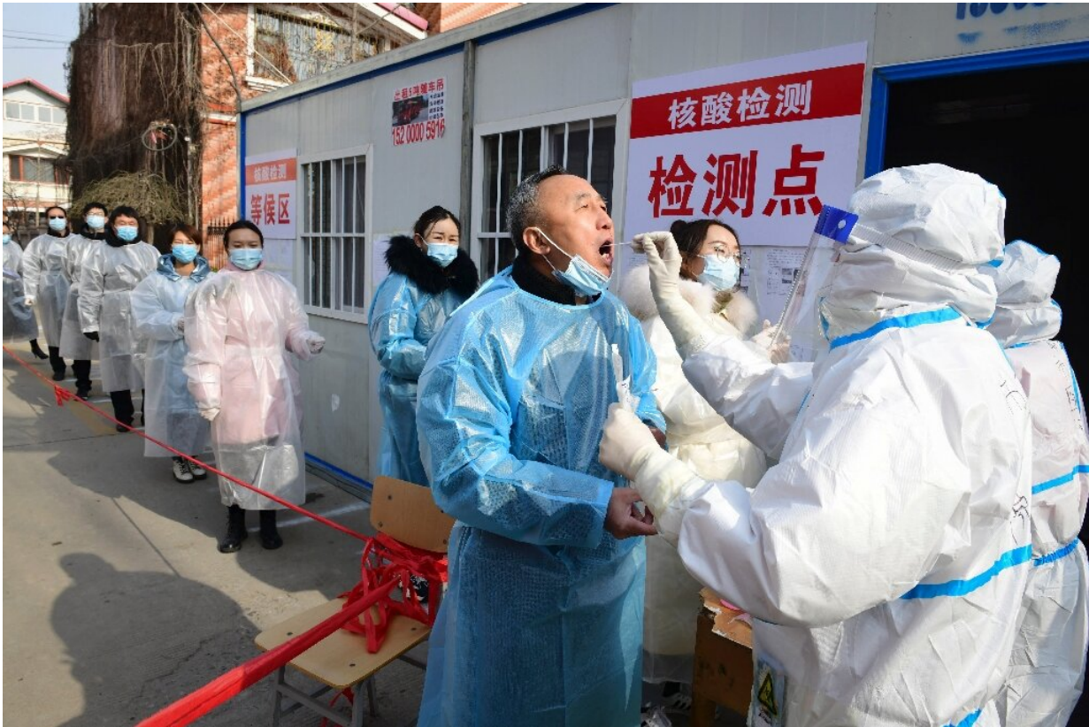
Residents of Shijiazhuang in northern Hebei, China line up for Coronavirus tests

India, second to the United States in the number of coronavirus cases, launched one of the world's biggest vaccination drives Saturday, aiming to inoculate 300 million people by July.