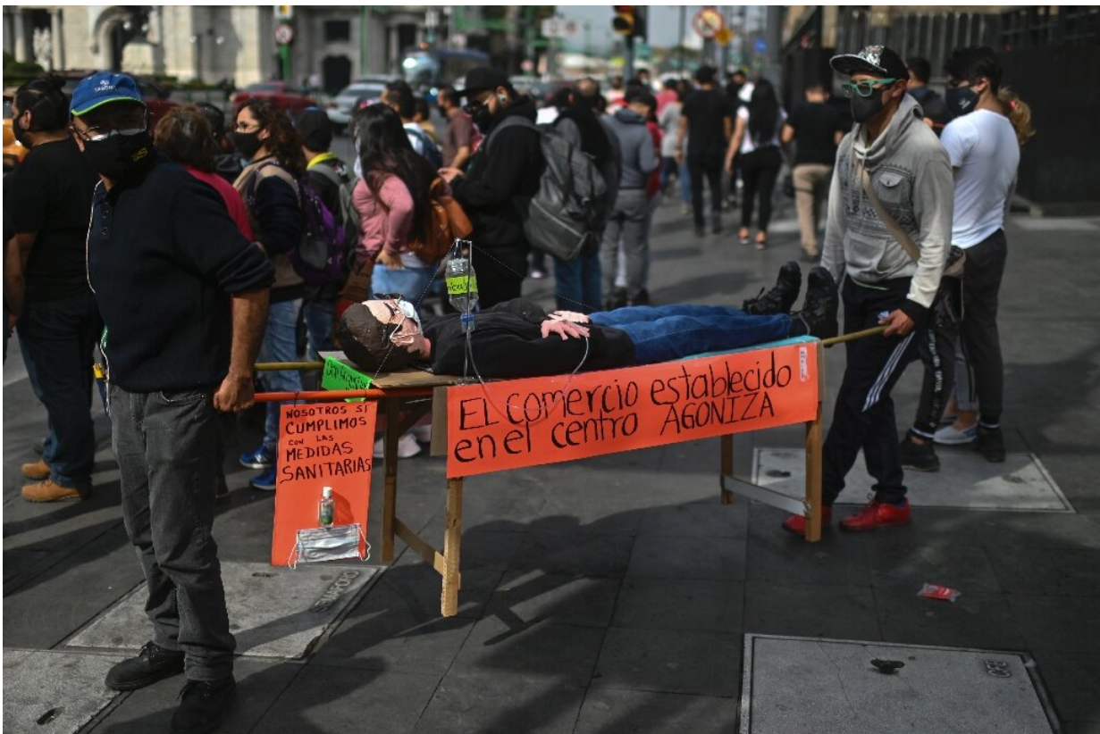
Lockdown protesters carry a mannequin symbolising ailing businesses in Mexico City.

The worldwide surge in cases, fuelled in part by new virus variants, have forced the reimposition of deeply unpopular restrictions on populations tiring of social distancing and the economic pain.