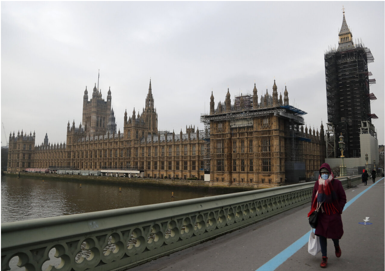
A woman wearing a face mask, walks across Westminster Bridge past the Houses of Parliament in London, Friday, Jan. 8, 2021. Britain's Prime Minister Boris Johnson has ordered a new national lockdown for England which means people will only be able to leave their homes for limited reasons, with measures expected to stay in place until mid-February.