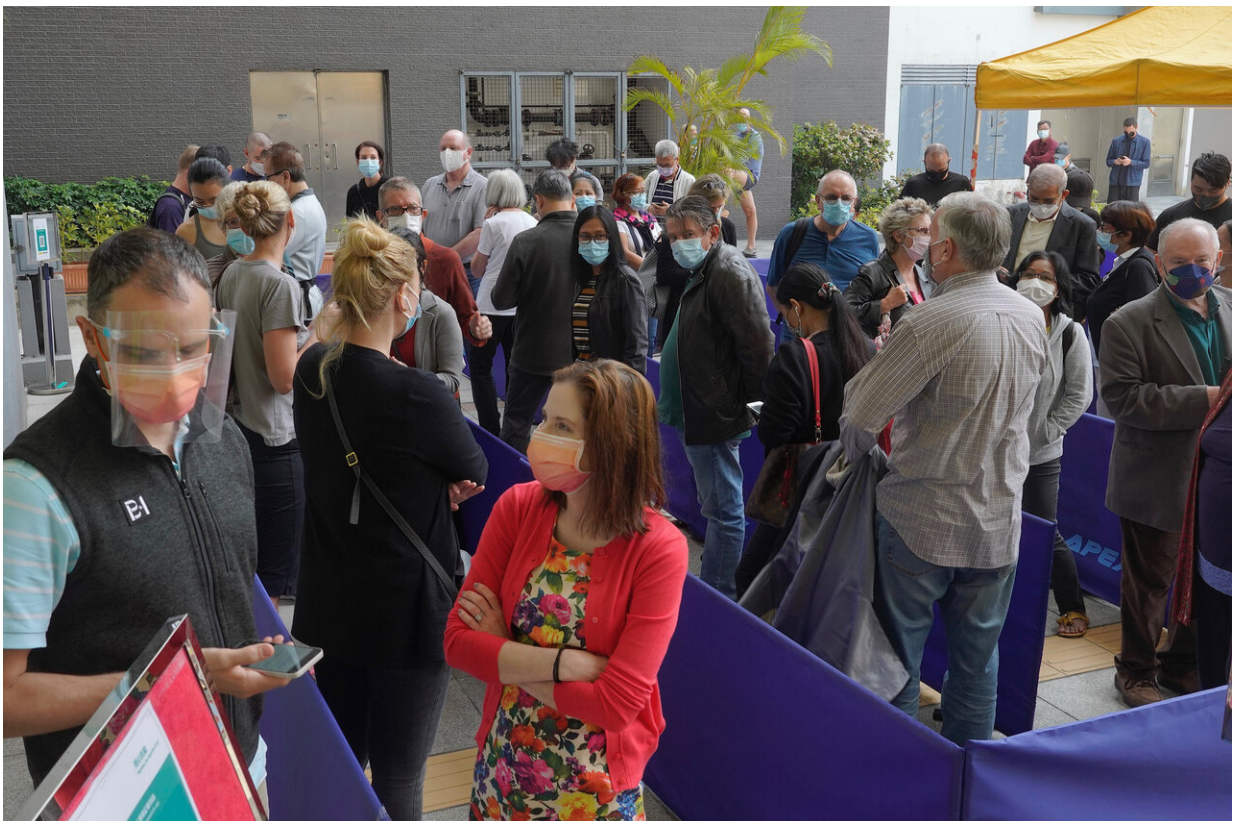
People queue up outside a vaccination center for BioNTech in Hong Kong Wednesday, March 24, 2021. Hong Kong suspended vaccinations using Pfizer

"I'm not very concerned about the safety, but I am worried that this may mean more people will turn down the option of getting vaccinated in Hong Kong which would impact herd immunity and the lifting of social-distancing measures," he said.