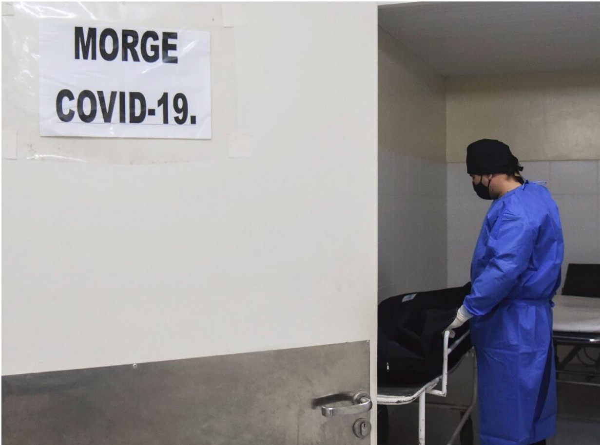
A healthworker at a morgue in Paraguay

The WHO is concerned that the pandemic could worsen in the Middle East and North Africa during the Muslim fasting month of Ramadan.