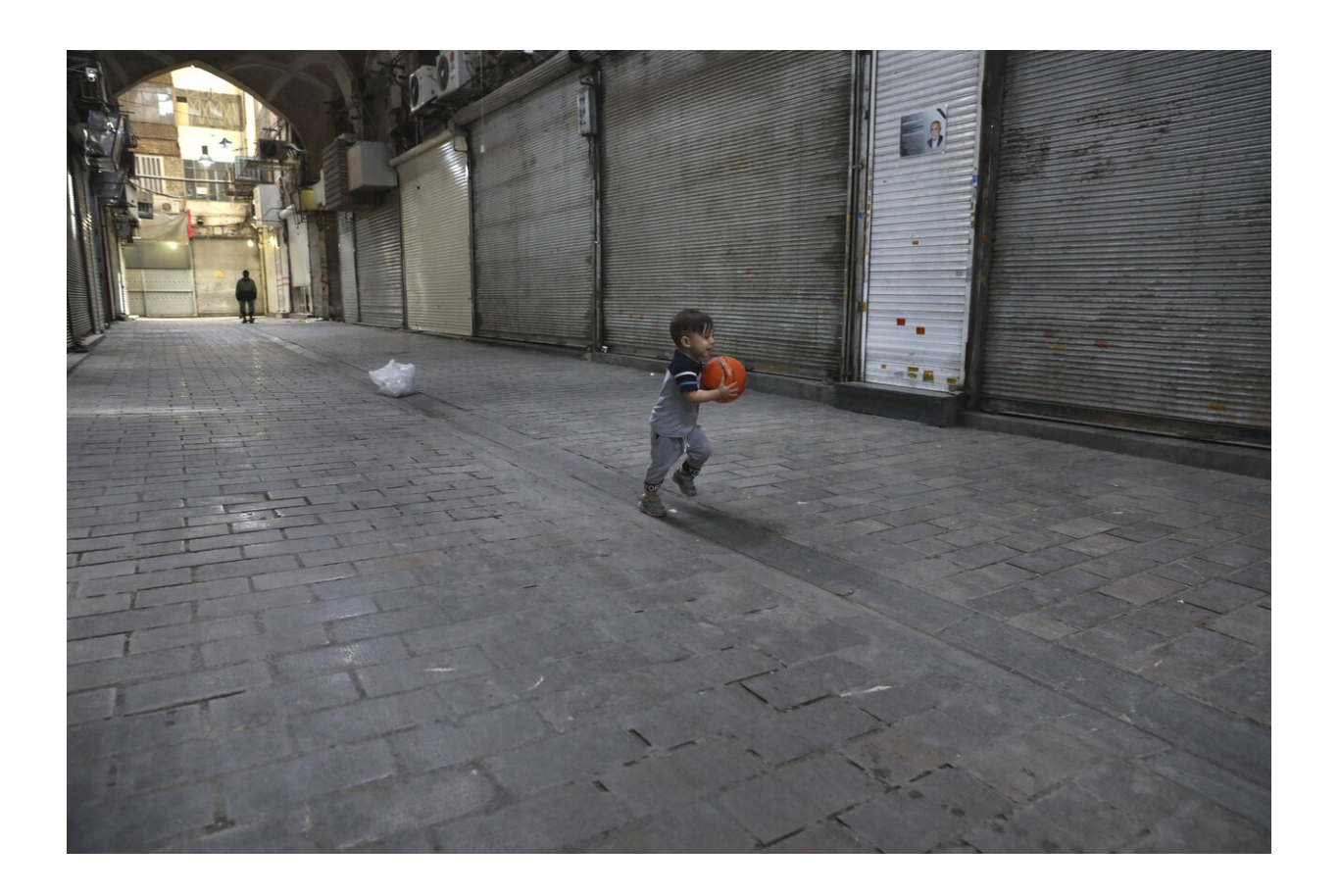
Arman, 2, plays in front of closed shops of Tehran's Grand Bazaar, Iran, Saturday, April 10, 2021. Iran on Saturday imposed partial lockdown on businesses in major shopping centers as well as intercity travels through personal cars in major cities including capital Tehran as it struggles with the worst outbreak of the coronavirus in the Mideast region.