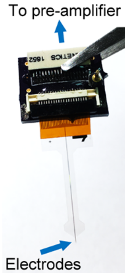
The neural implant connected to a customized printed circuit board.