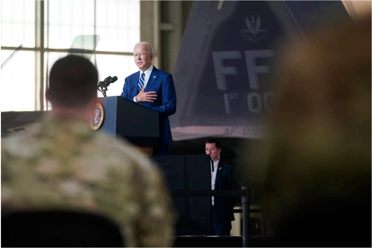
President Joe Biden speaks at Joint Base Langley-Eustis in Hampton, Va., Friday, May 28, 2021.