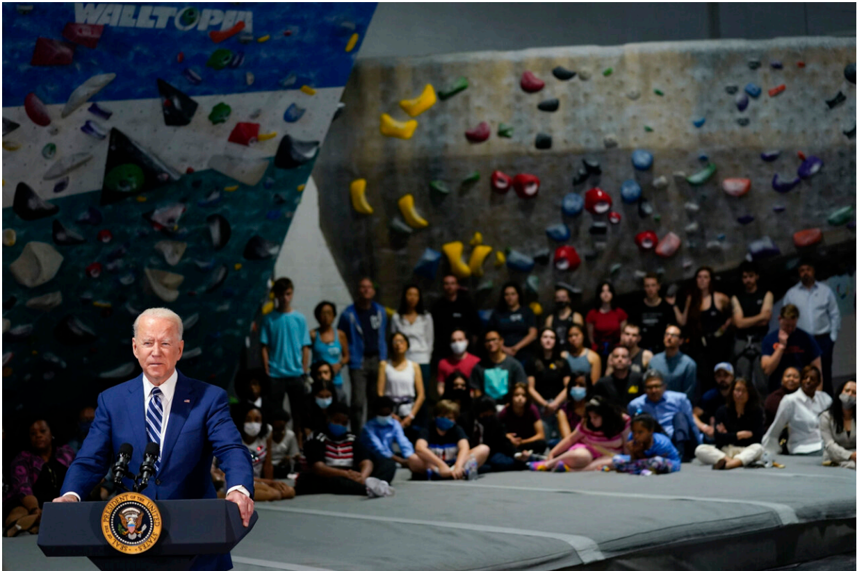
President Joe Biden speaks at Sportrock Climbing Centers, Friday, May 28, 2021, in Alexandria, Va.