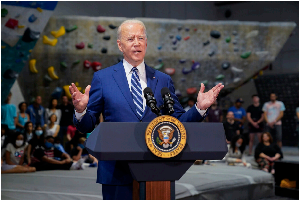
President Joe Biden speaks at Sportrock Climbing Centers, Friday, May 28, 2021, in Alexandria, Va.

The visit came as Biden is pressing Republican lawmakers to back a massive infrastructure bill to rebuild roadways and bridges, replace millions of lead waterpipes and more—something that the White House is pitching as a salve for an economy as the U.S. turns the corner on the worst public health crisis in more than a century.