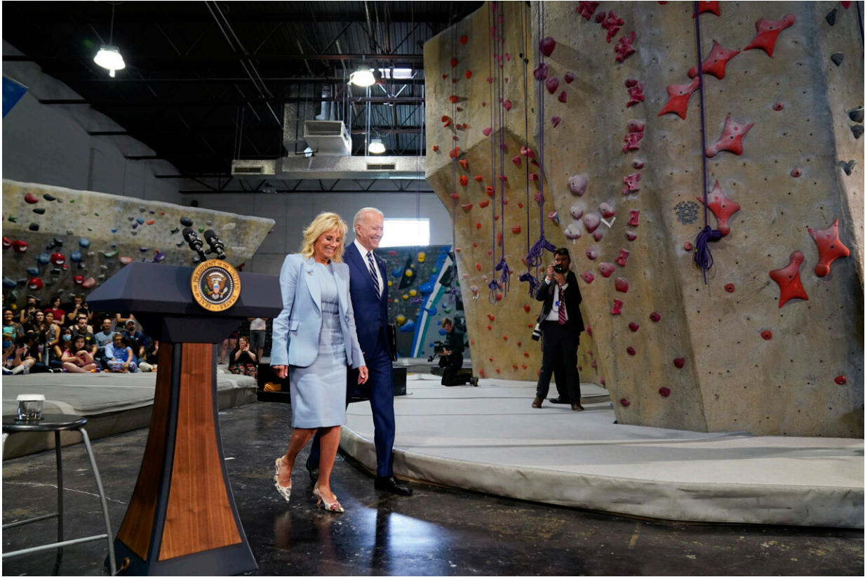
President Joe Biden leaves with first lady Jill Biden after speaking at Sportrock Climbing Centers, Friday, May 28, 2021, in Alexandria, Va.