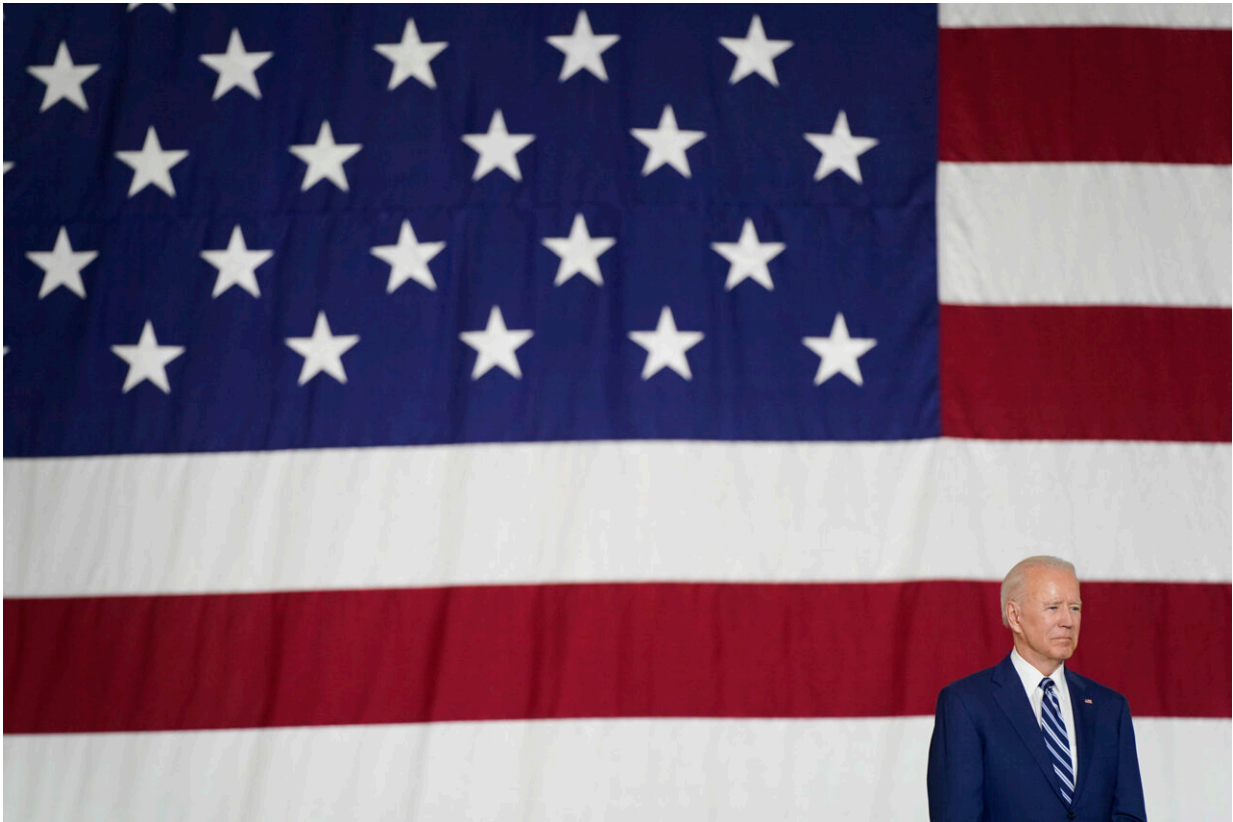
President Joe Biden listens as first lady Jill Biden speaks at Joint Base Langley-Eustis in Hampton, Va., Friday, May 28, 2021.