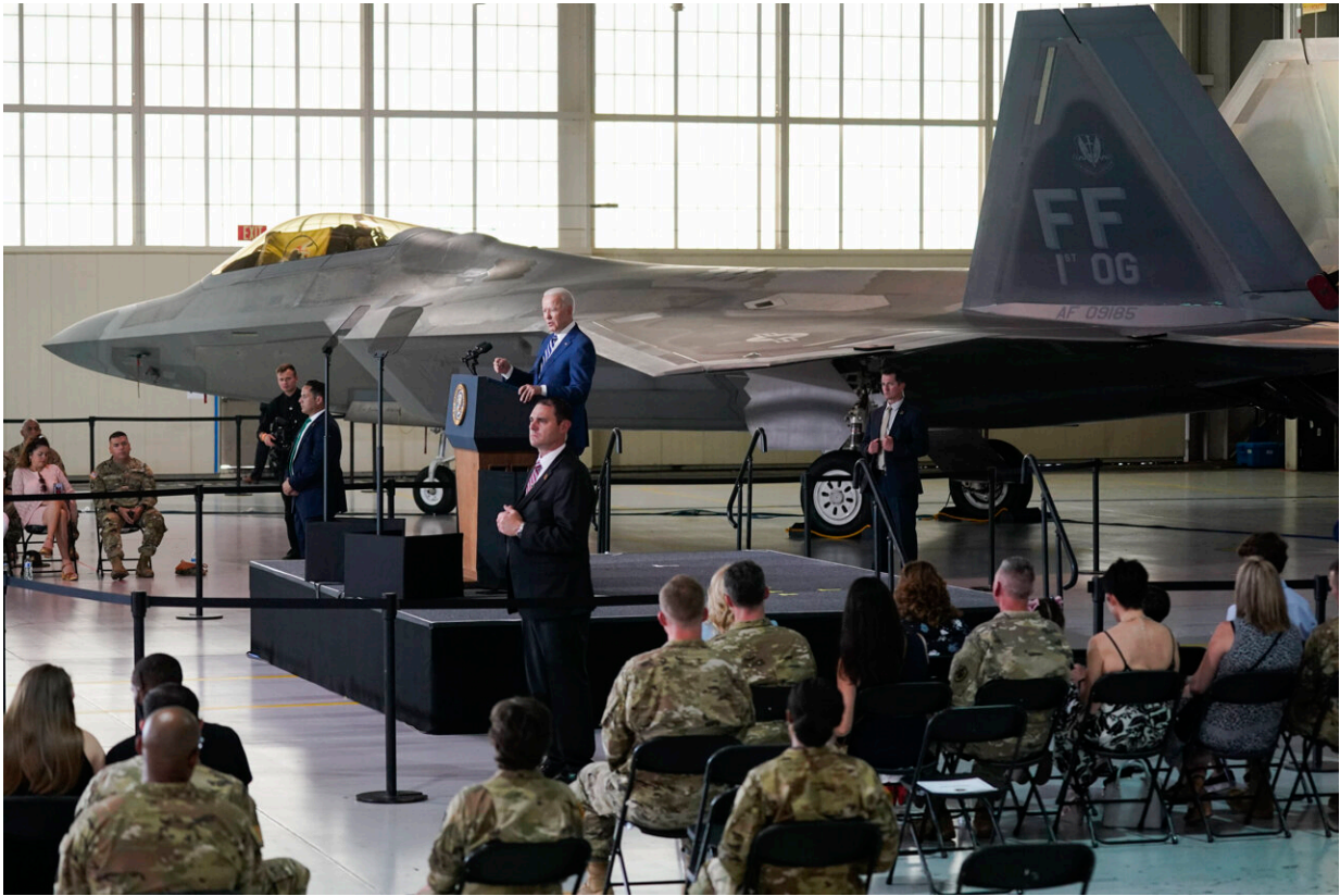
President Joe Biden speaks at Joint Base Langley-Eustis in Hampton, Va., Friday, May 28, 2021.