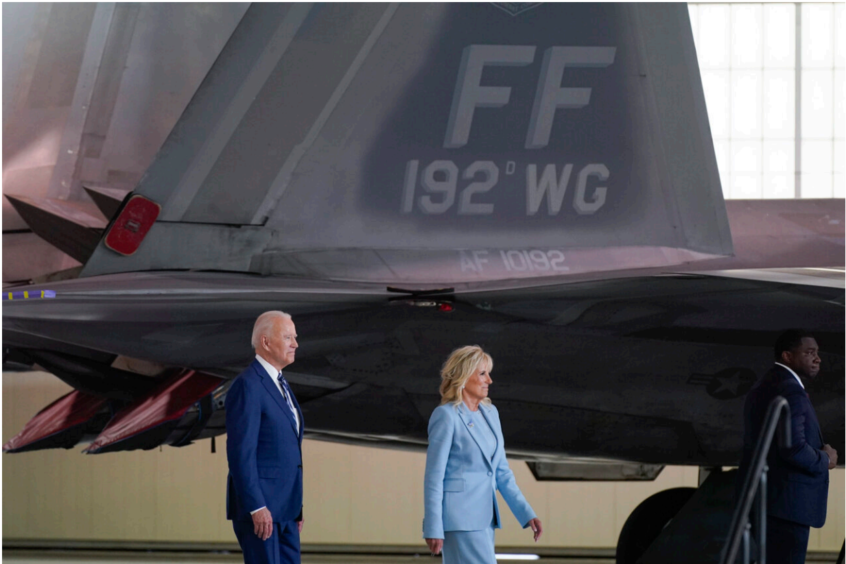
President Joe Biden and first lady Jill Biden arrive to speak at Joint Base Langley-Eustis in Hampton, Va., Friday, May 28, 2021.