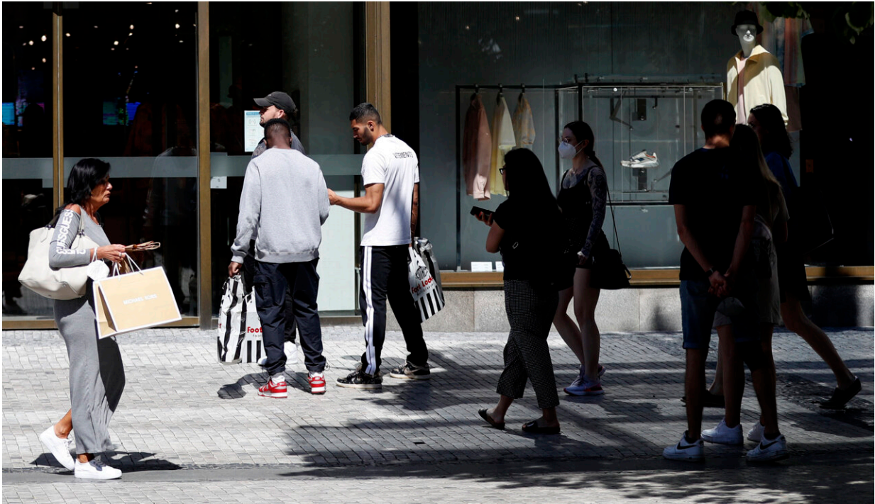
People wait in line in front of a shop in Prague, Czech Republic, Monday, May 10, 2021. The Czech Republic is massively relaxing its coronavirus restrictions as the hard-hit nation pay respect to nearly 30,000 dead. Monday's wave of easing came after the new infections fell to the levels unseen from August when the government failed to react in time to an opposite trend, the growing numbers of infected which later contributed to record numbers of deaths.