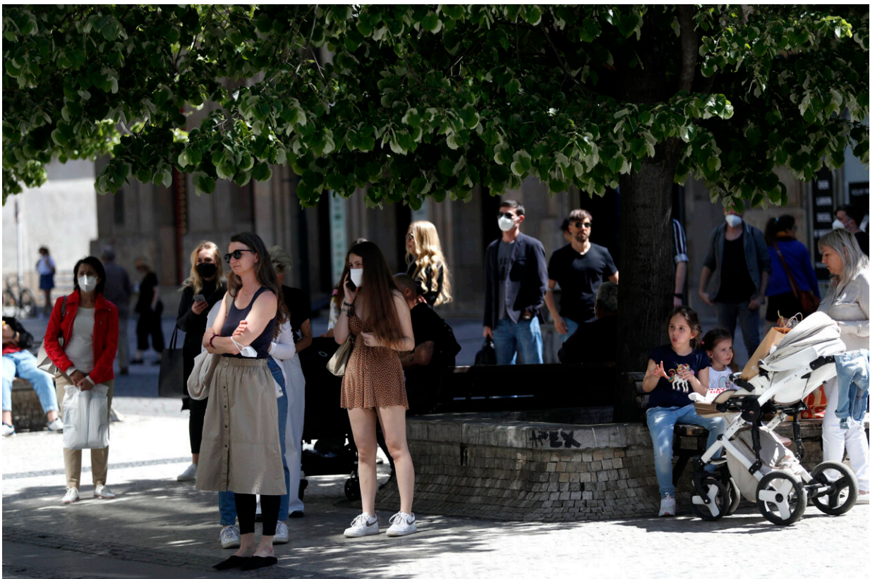
People wait in line in front of a shop in Prague, Czech Republic, Monday, May 10, 2021. The Czech Republic is massively relaxing its coronavirus restrictions

The government was set to discuss later on Monday a plan to allow spectators to attend concerts and other cultural events. The Culture Ministry proposed that up to 700 people could attend outdoor events while the number would be limited to 400 indoors.