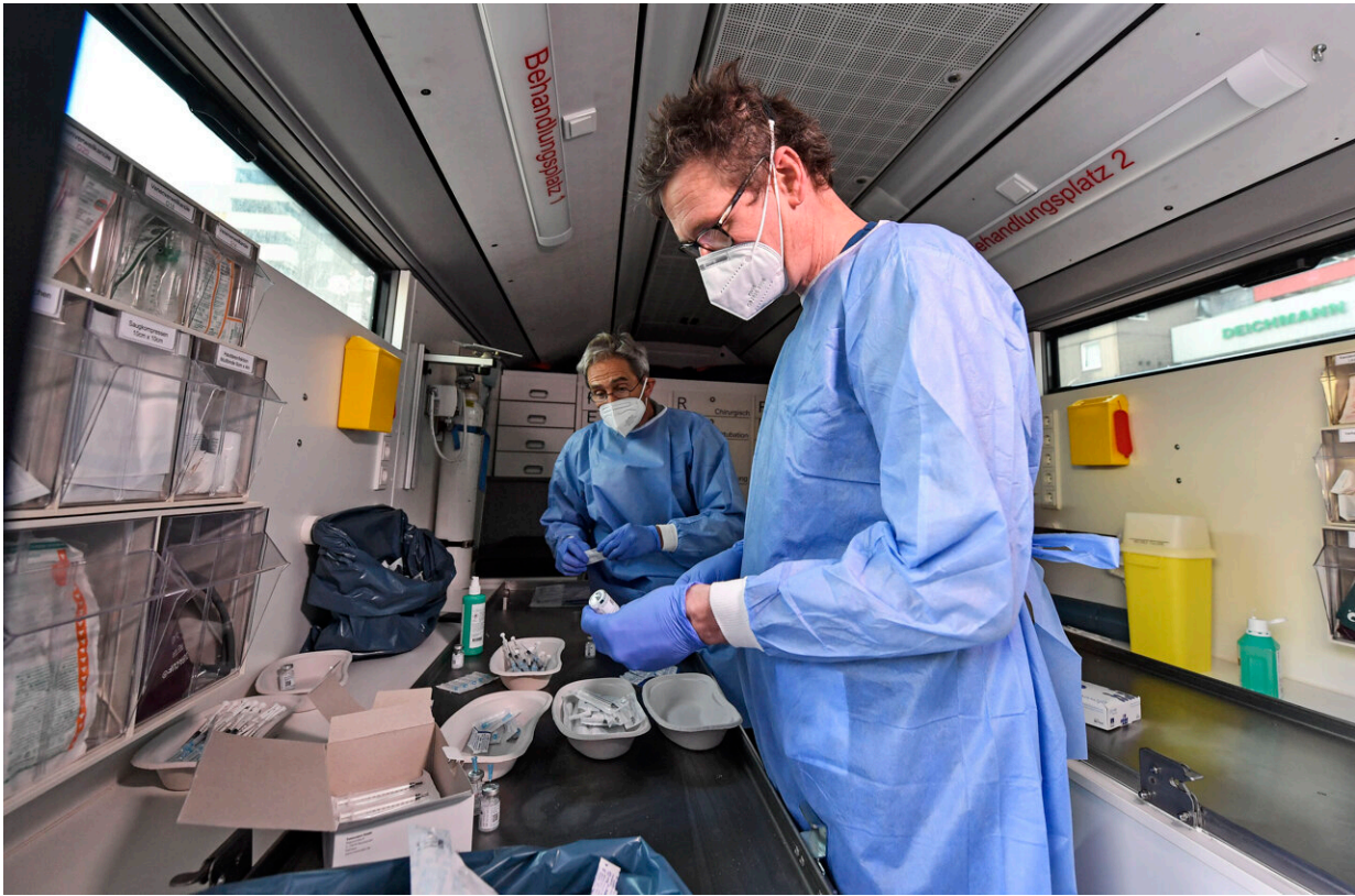
Medical staff prepares Moderna vaccination in a vaccination mobile on a square at the district Chorweiler in Cologne, Germany, Monday, May 3, 2021. The city of Cologne started a program to bring COVID-19 vaccination to people living in this neighborhood with a high corona incidence.