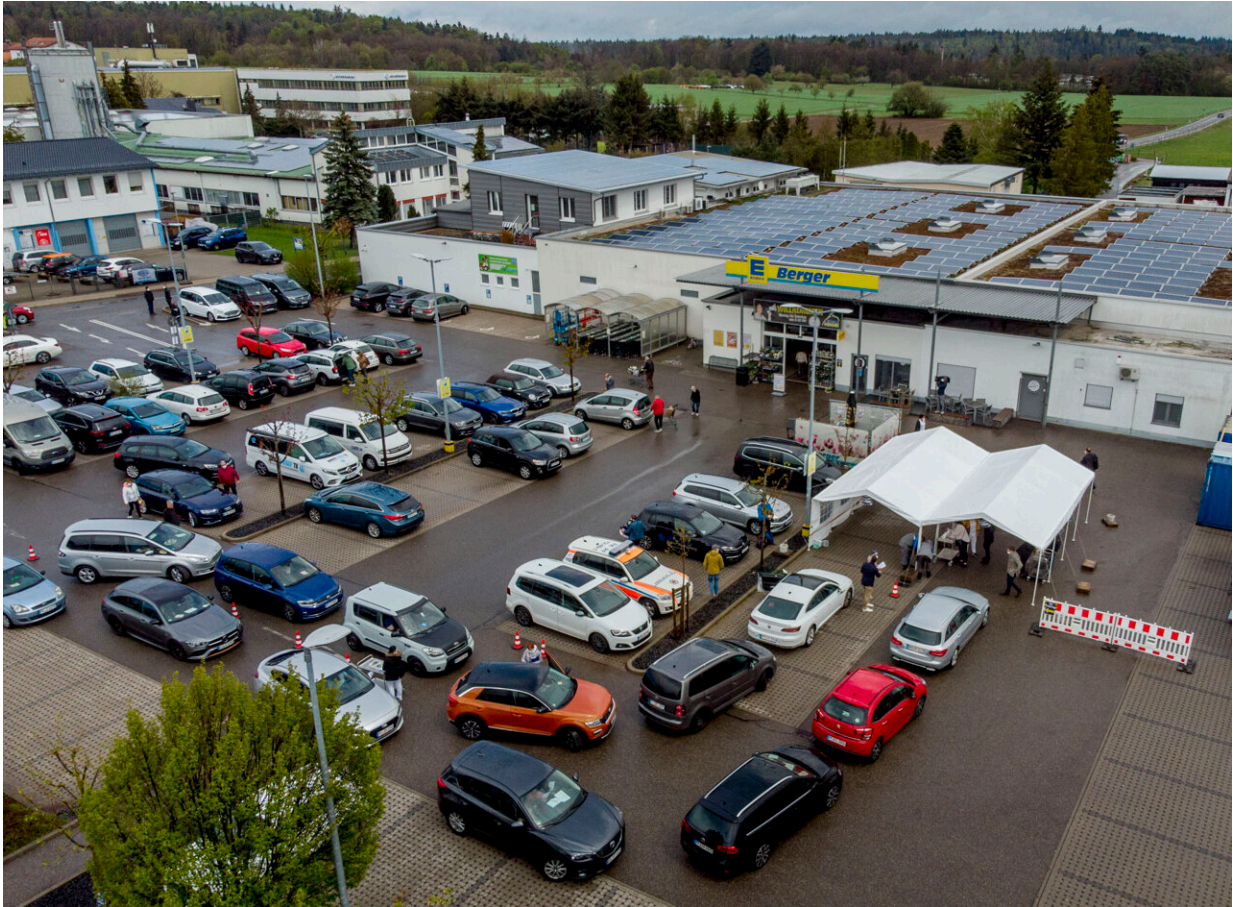
Cars with people waiting for AstraZeneca vaccination queue in front of a tent on the parking lot of a supermarket in Pforzheim, southern Germany, Wednesday, May 5, 2021. A doctor who could not get rid of her AstraZeneca vaccine in her doctor's office decided to offer some 250 doses in drive-in location at the supermarket.