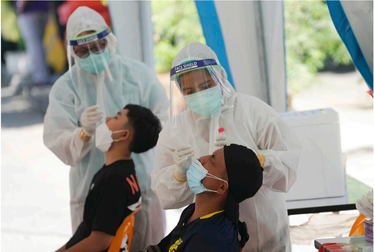
Health workers collect nasal swabs from men for coronavirus testing in Bangkok, Thailand, Tuesday, June 1, 2021.