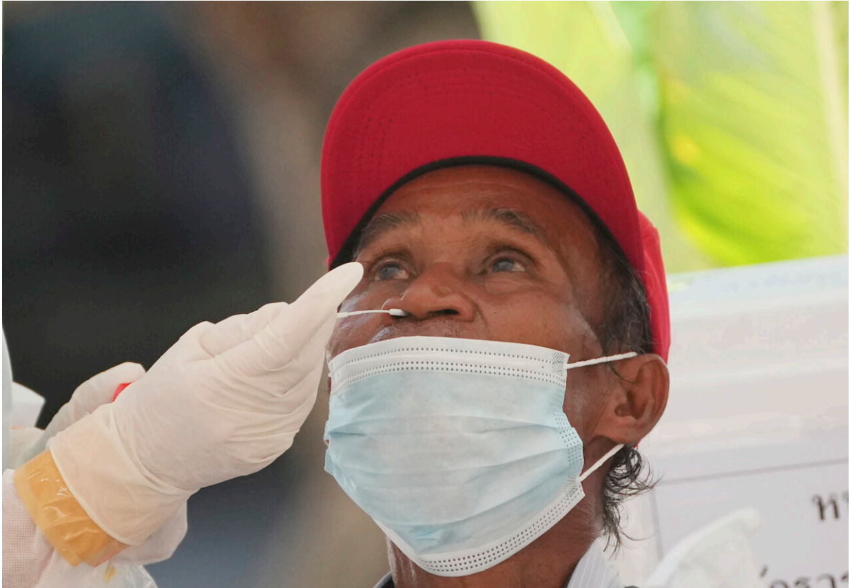
A health worker collects a nasal swab from a man for a coronavirus test in Bangkok, Thailand, Tuesday, June 1, 2021.