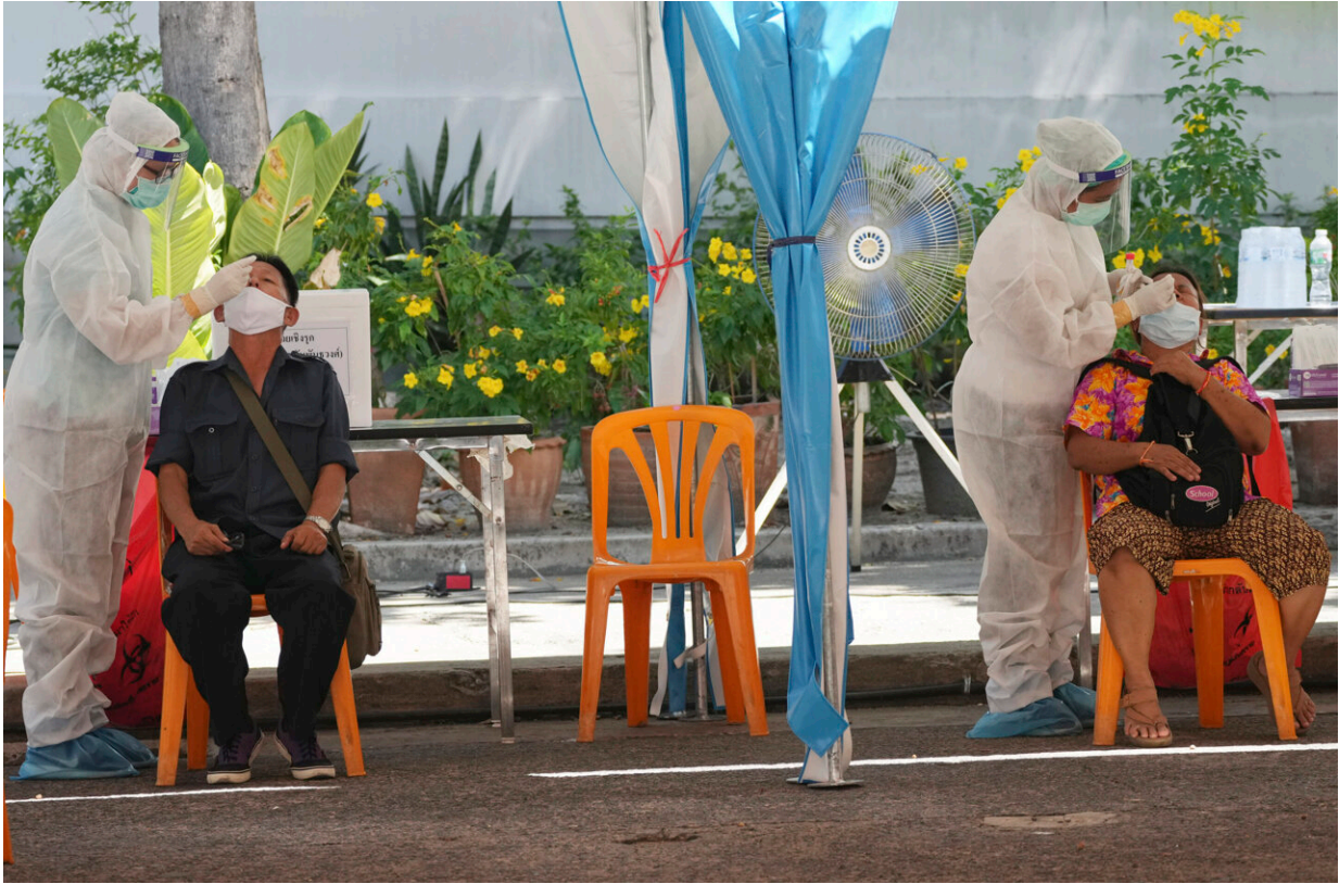
Health workers collect nasal swabs from local residents for coronavirus testing in Bangkok, Thailand, Tuesday, June 1, 2021.

Thailand reported 3,440 new cases on Wednesday, bringing a total number of confirmed cases to 165,462 since the pandemic started. More than 130,000 of those cases have been discovered since the beginning of April. The death toll stood at 1,107, with 1,013 of those since the start of April.