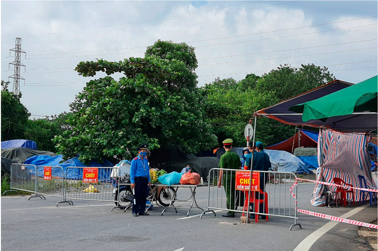
Policemen guard behind barricades set up to control the traffic in Hanoi, Vietnam, Saturday, July 24, 2021. Vietnam announced a 15-day lockdown in the capital Hanoi starting Saturday as a coronavirus surge spread from the southern Mekong Delta region.