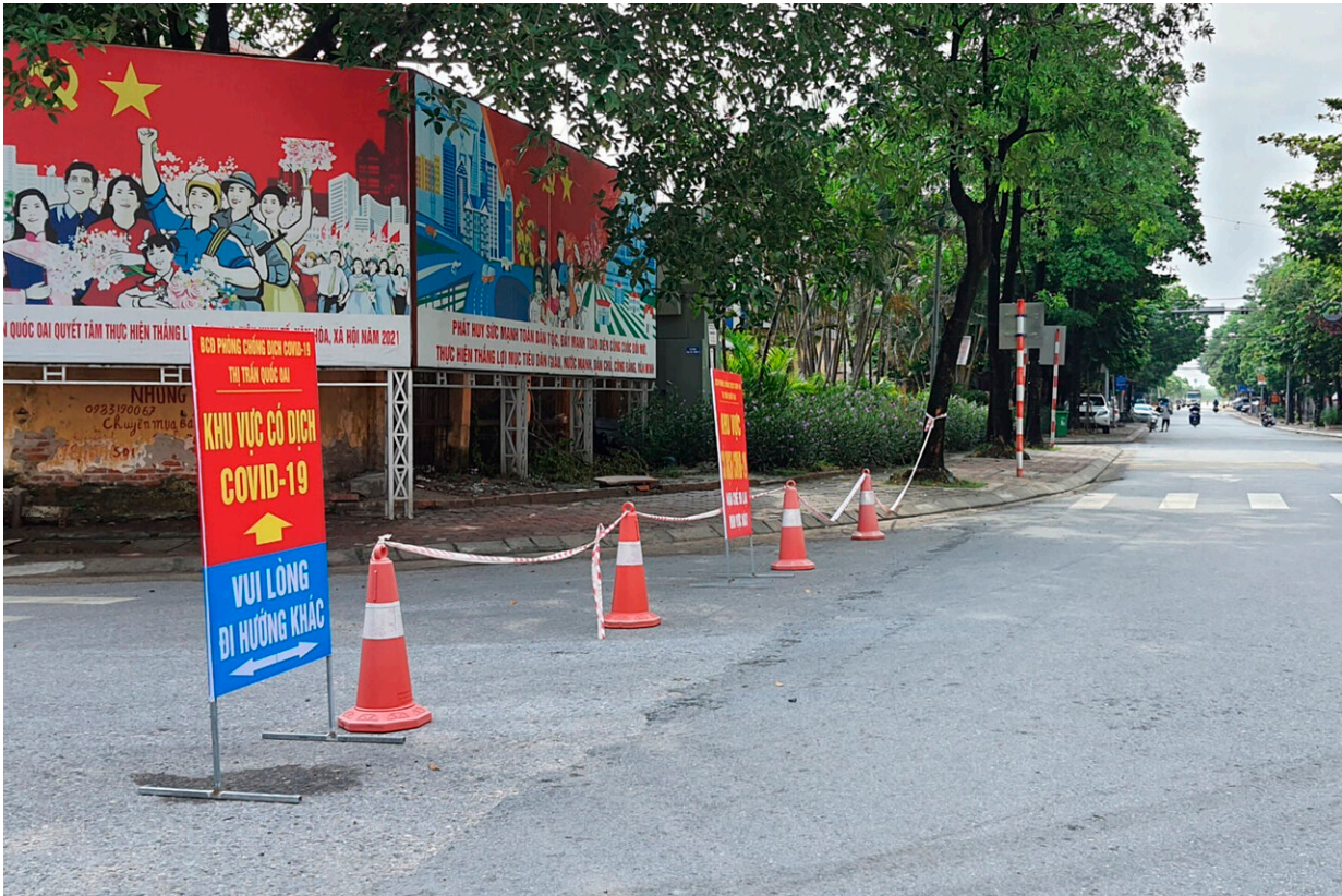
A street is cordoned off to control the traffic in Hanoi, Vietnam, Saturday, July 24, 2021. Vietnam announced a 15-day lockdown in the capital Hanoi starting Saturday as a coronavirus surge spread from the southern Mekong Delta region.