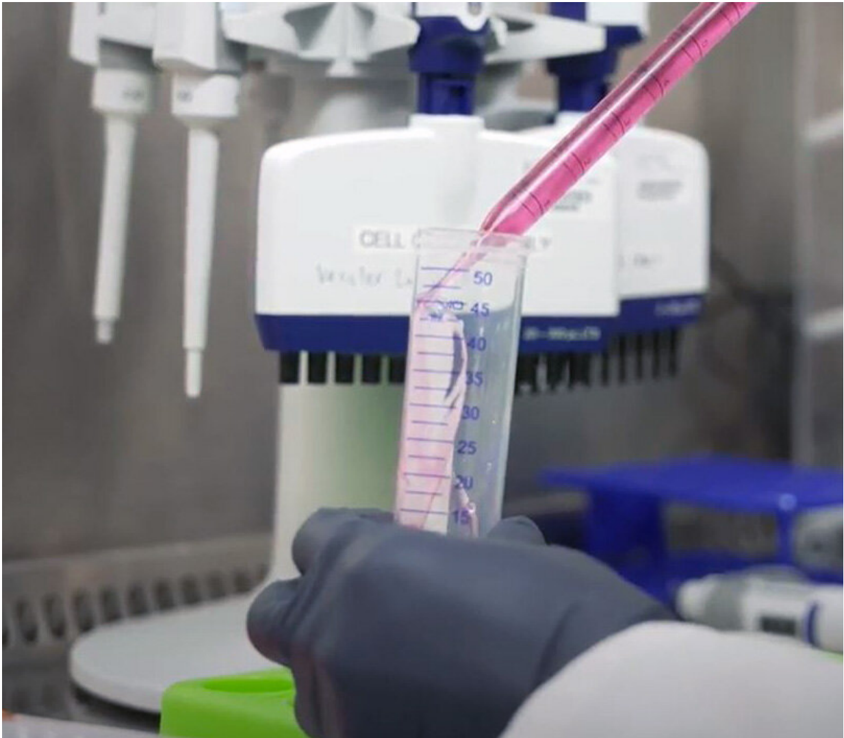
A close-up of a research procedure in the Veesler lab.

Studies of the plasma from pre-pandemic human samples, as well as from COVID-vaccinated and COVID-recovered individuals were also analyzed to see how frequently the stem-helix targeting antibodies appeared. They highest frequencies occurred in people who had recovered from COVID-19, then were later vaccinated. Overall, however, the data from this study shows that, while it does occur, it is