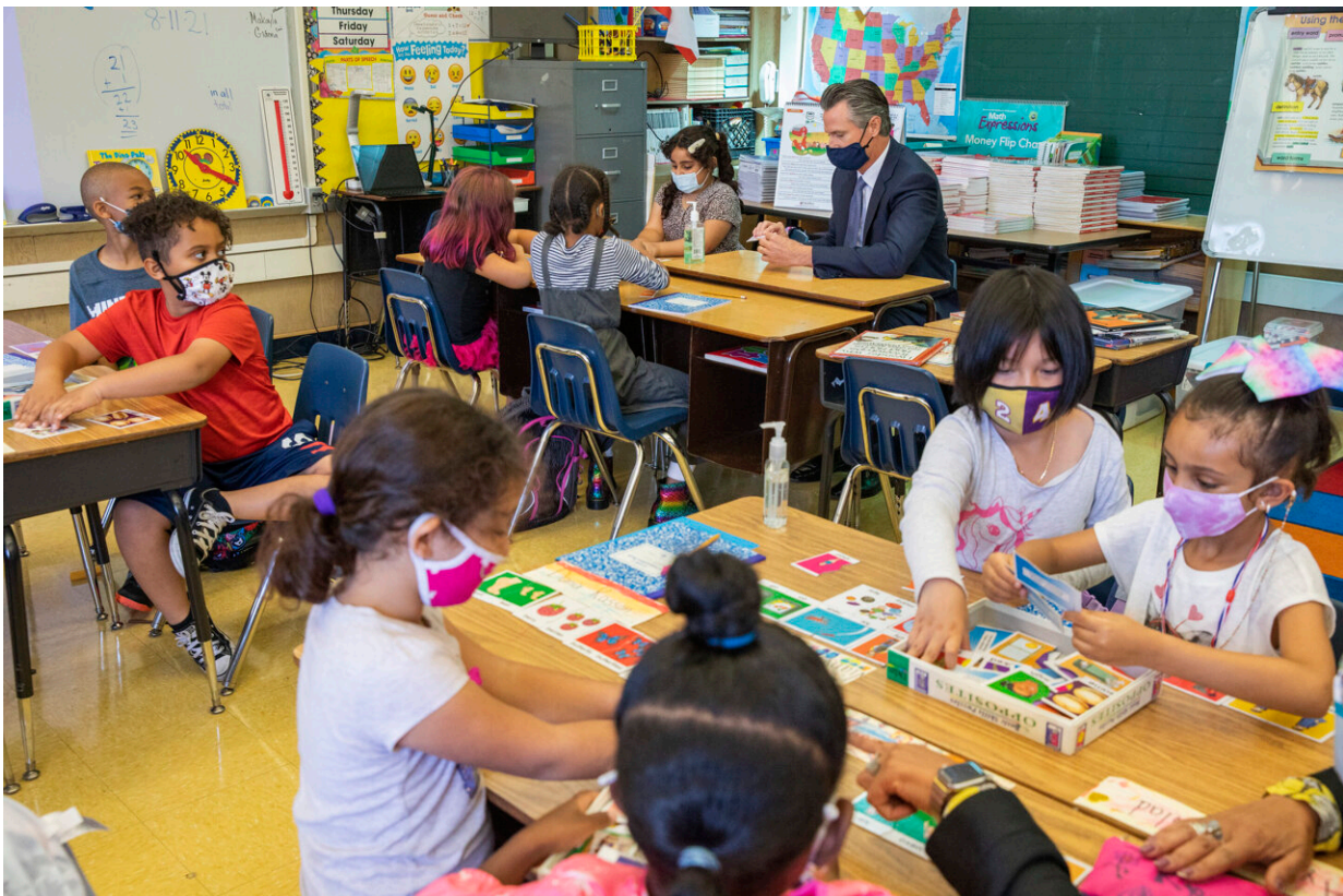
In this Aug. 11, 2021, file photo, California Gov. Gavin Newsom sits with students of a second grade classroom at Carl B. Munck Elementary School in