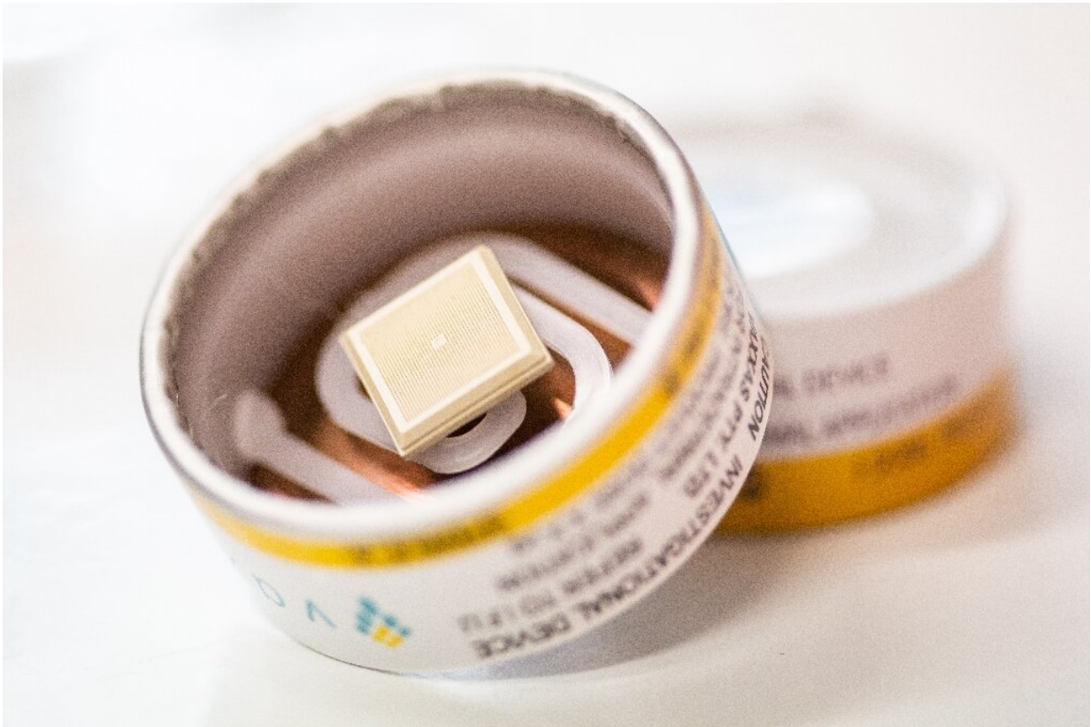
A skin patch and its applicator tested to vaccinate against Covid-19.

The latter, founded in 2013 and based in Massachusetts, is working on a slightly different type of patch, with microneedles that dissolve in the skin.