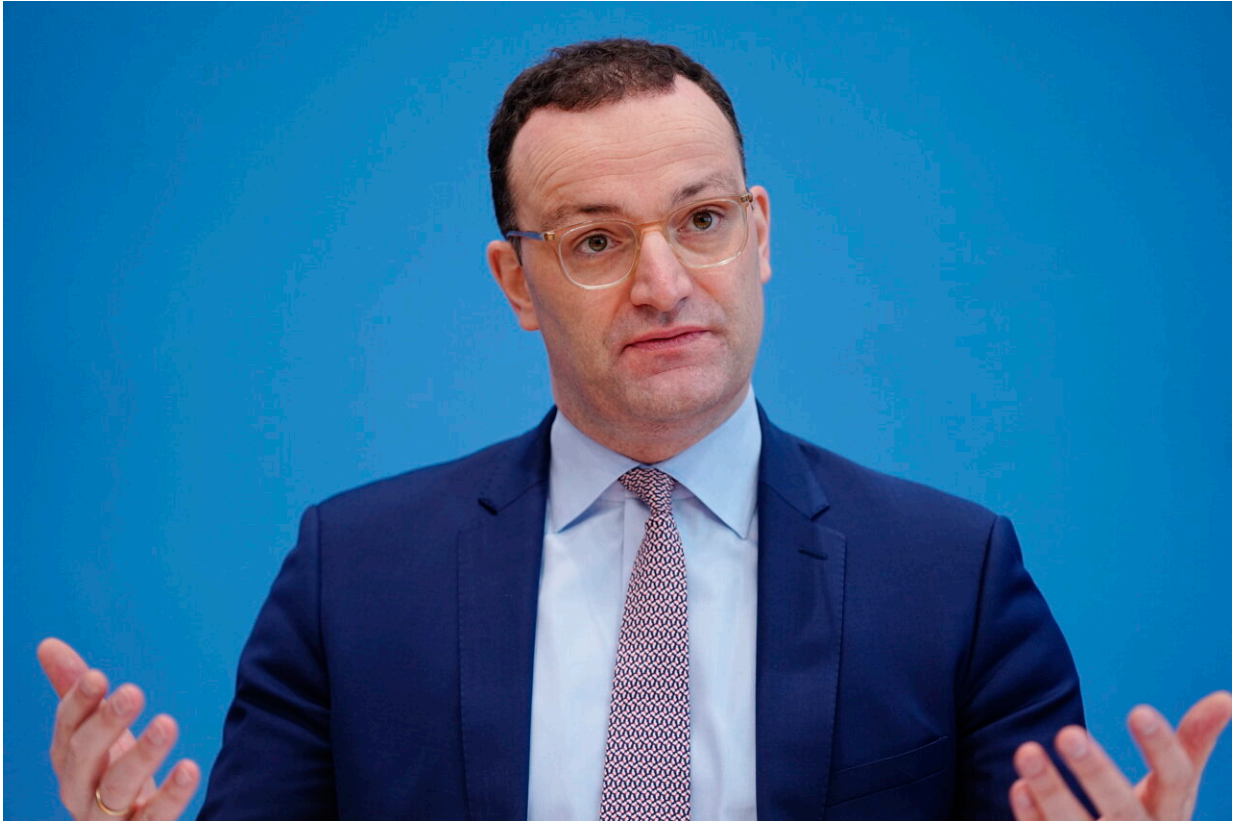
Jens Spahn, Executive Federal Minister for Health, gives a press conference on the development in the Corona pandemic at the Federal Press Conference in Berlin, Germany, Friday, Dec. 3, 2021.