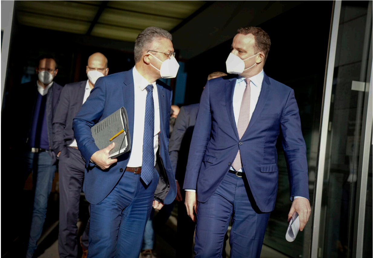
Jens Spahn, Executive Federal Minister of Health, and Lothar H. Wieler, President of the Robert Koch Institute (RKI), from right, leave the Federal Press Conference after a press conference on developments in the Corona pandemic in Berlin, Germany, Friday, Dec. 3, 2021.