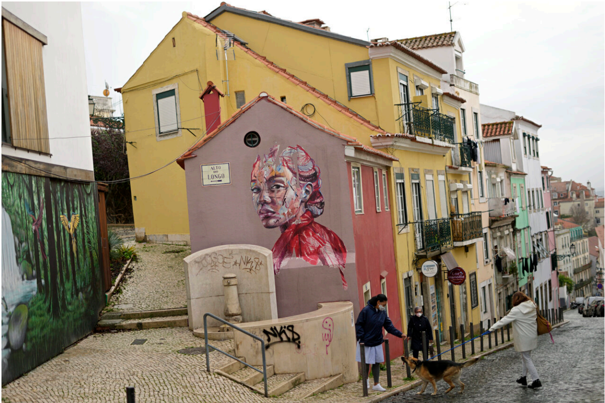
Women wearing face masks stop to chat when crossing each other on the street in Lisbon, Tuesday, Dec. 21, 2021. Portugal holds an extraordinary Cabinet meeting today with the government expected to announce some tinkering with the COVID-19 pandemic measures ahead of the holidays.