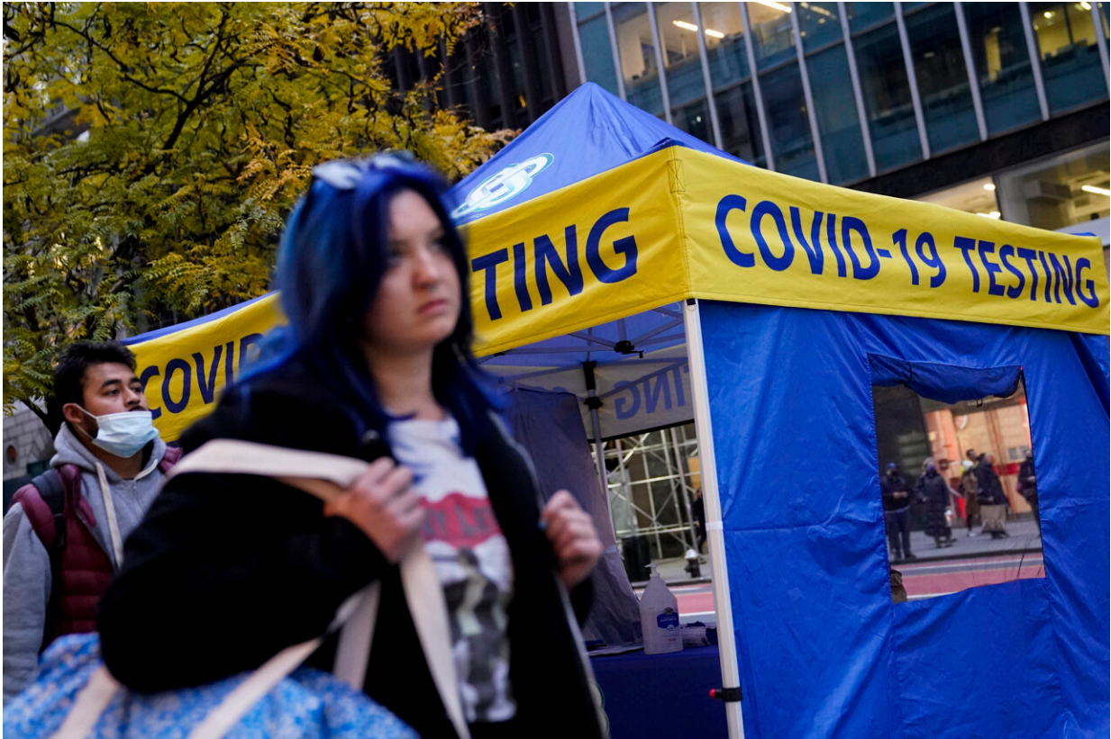
Pedestrians pass a COVID-19 testing tent on 42nd Street, Thursday, Dec. 2, 2021, in the Manhattan borough of New York. Health officials say multiple cases of the omicron coronavirus variant have been detected in New York, including a man who attended an anime convention in Manhattan in late November and tested positive for the variant when he returned home to Minnesota.