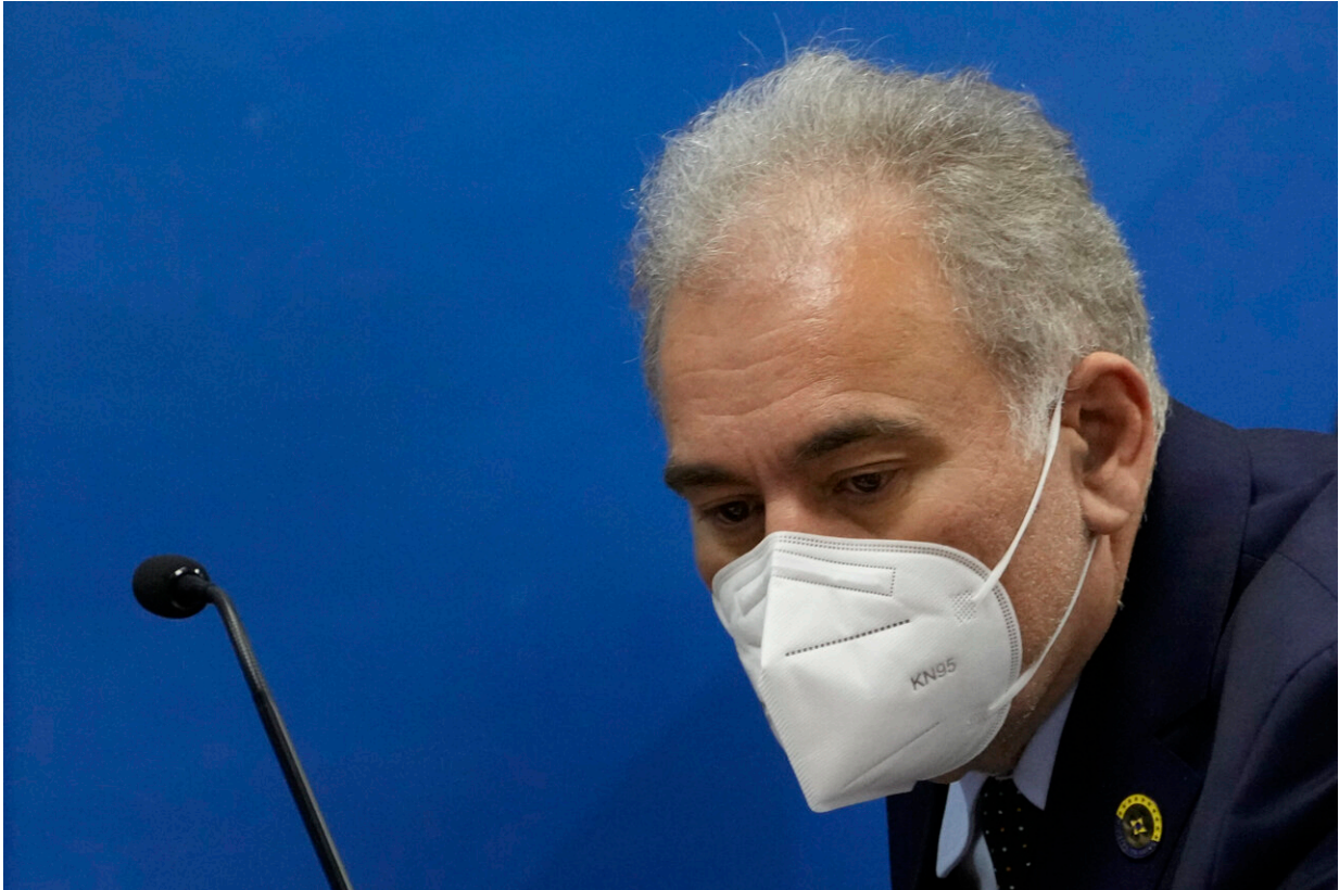
Brazil's Health Minister Marcelo Queiroga announces guidelines for vaccinating children with the COVID-19 vaccine, during a press conference, in Brasilia, Brazil, Wednesday, Jan. 5, 2022.