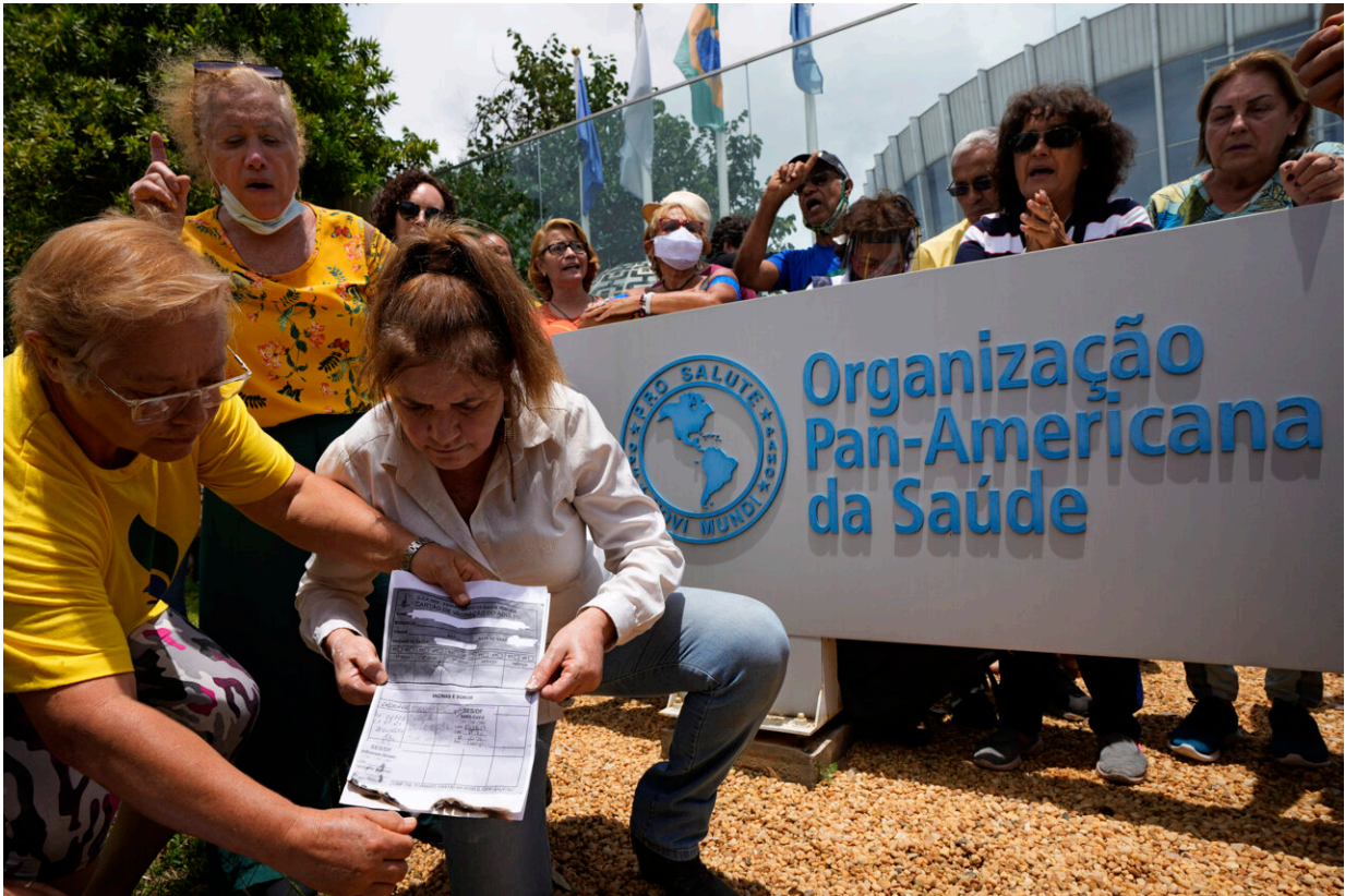
Demonstrators set fire to a COVID-19 vaccination card during a protest outside the Pan American Health Organization headquarters against COVID-19 vaccine passports and obligatory vaccines for COVID-19 for children, during a protest organized by supporters of Brazilian President Jair Bolsonaro in Brasilia, Brazil, Tuesday, Jan. 4, 2022.