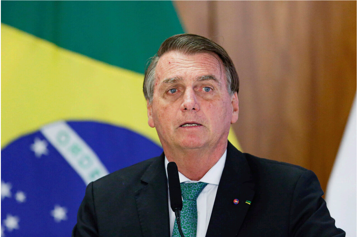
El presidente de Brasil, Jair Bolsonaro, en conferencia de prensa desde el Palacio de Planalto en Brasilia, el 24 de noviembre de 2021.