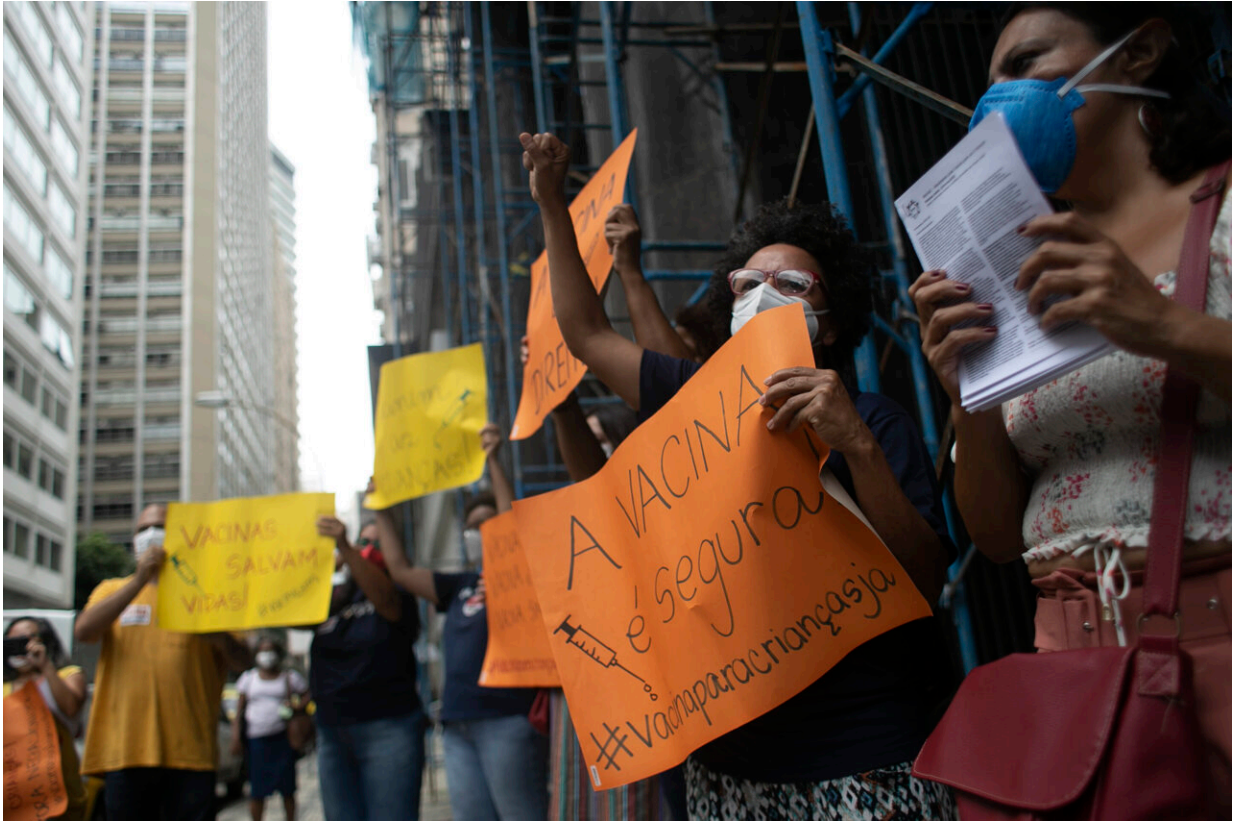
People demonstrate in favor of COVID-19 vaccinations for children outside Rio state's Ministry of Health office in Rio de Janeiro, Brazil, Wednesday, Jan. 5, 2022.