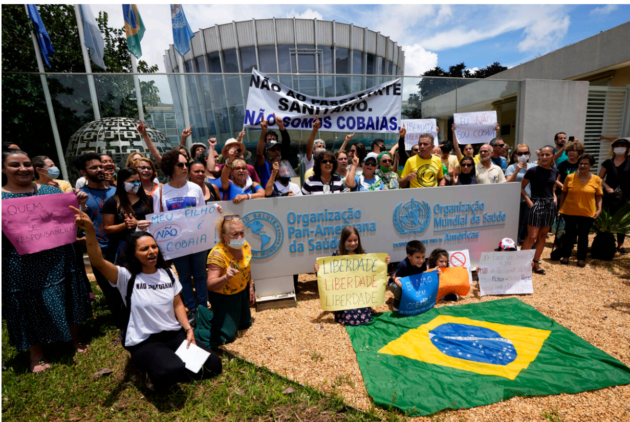
People protest against COVID-19 vaccine passports and obligatory vaccines for COVID-19 for children during a protest organized by supporters of Brazilian President Jair Bolsonaro at the Pan American Health Organization headquarters in Brasilia, Brazil, Tuesday, Jan. 4, 2022.