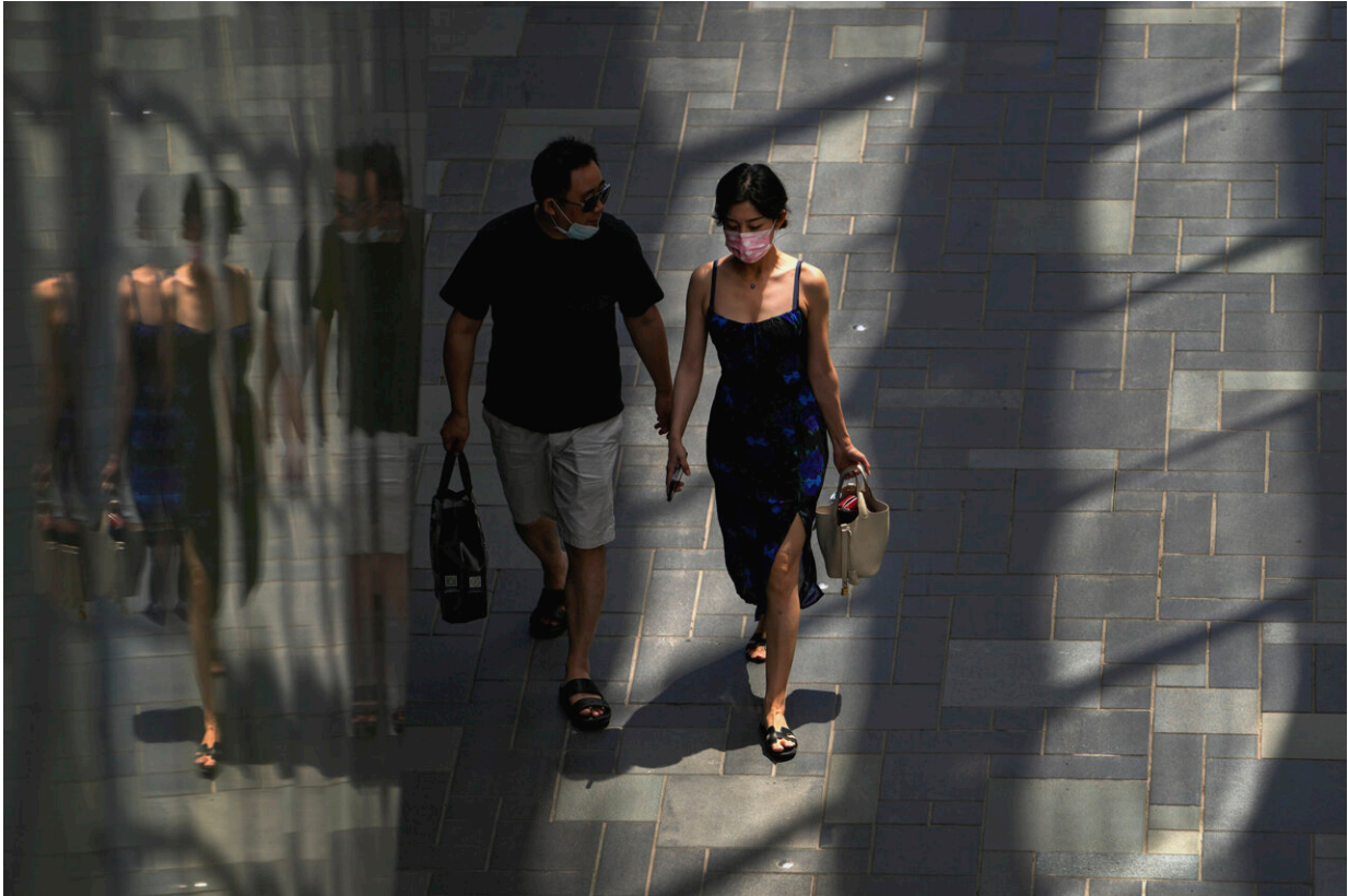
A couple wearing face masks walk through a shopping mall in Beijing, Monday, June 6, 2022. Diners returned to restaurants Monday in most of Beijing for the first time in more than a month as authorities further eased pandemic-related restrictions after largely eradicating a small COVID-19 outbreak under China's strict "zero-COVID" approach.