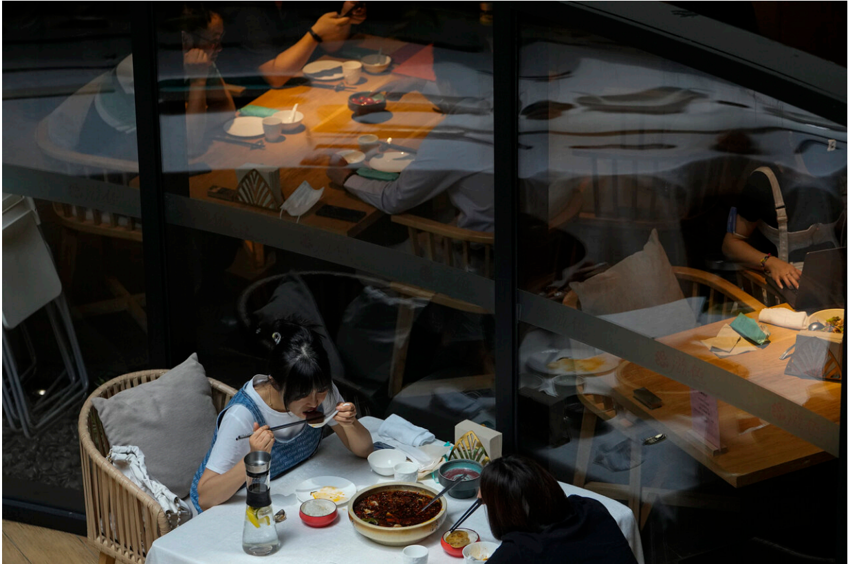
People eat lunch at a reopened restaurant in a shopping mall as new COVID-19 cases drop in Beijing Monday, June 6, 2022.