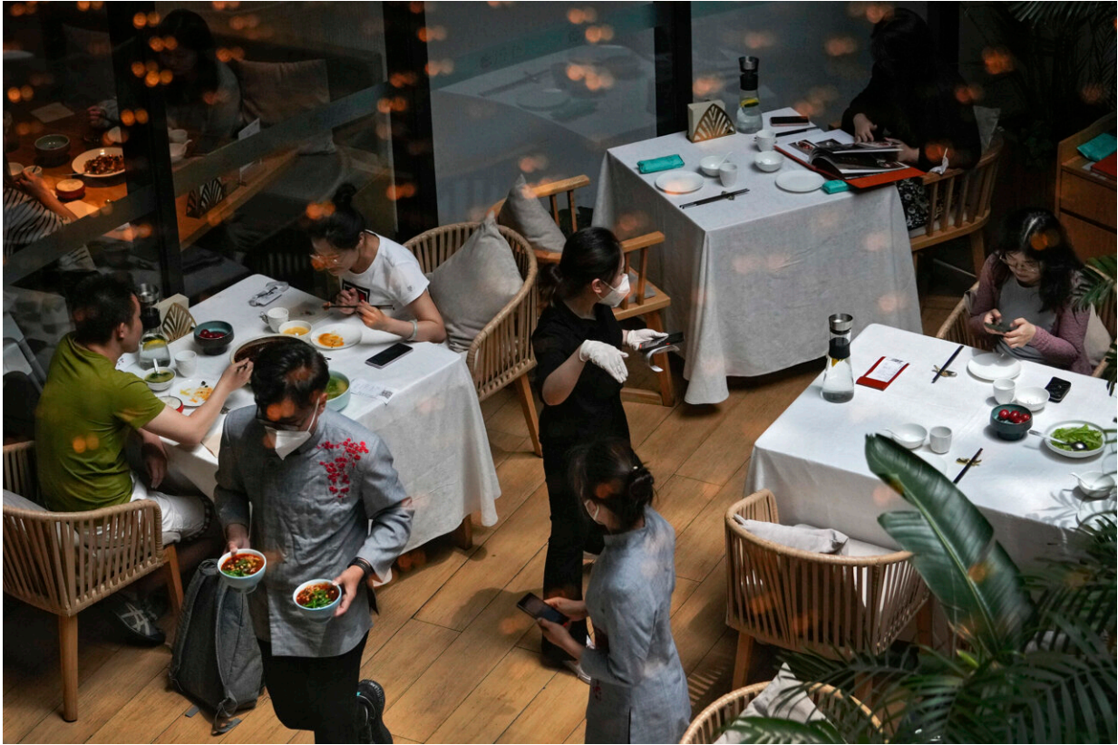
Waitresses serve customers at a reopened restaurant in a shopping mall as new COVID-19 cases drop in Beijing Monday, June 6, 2022.