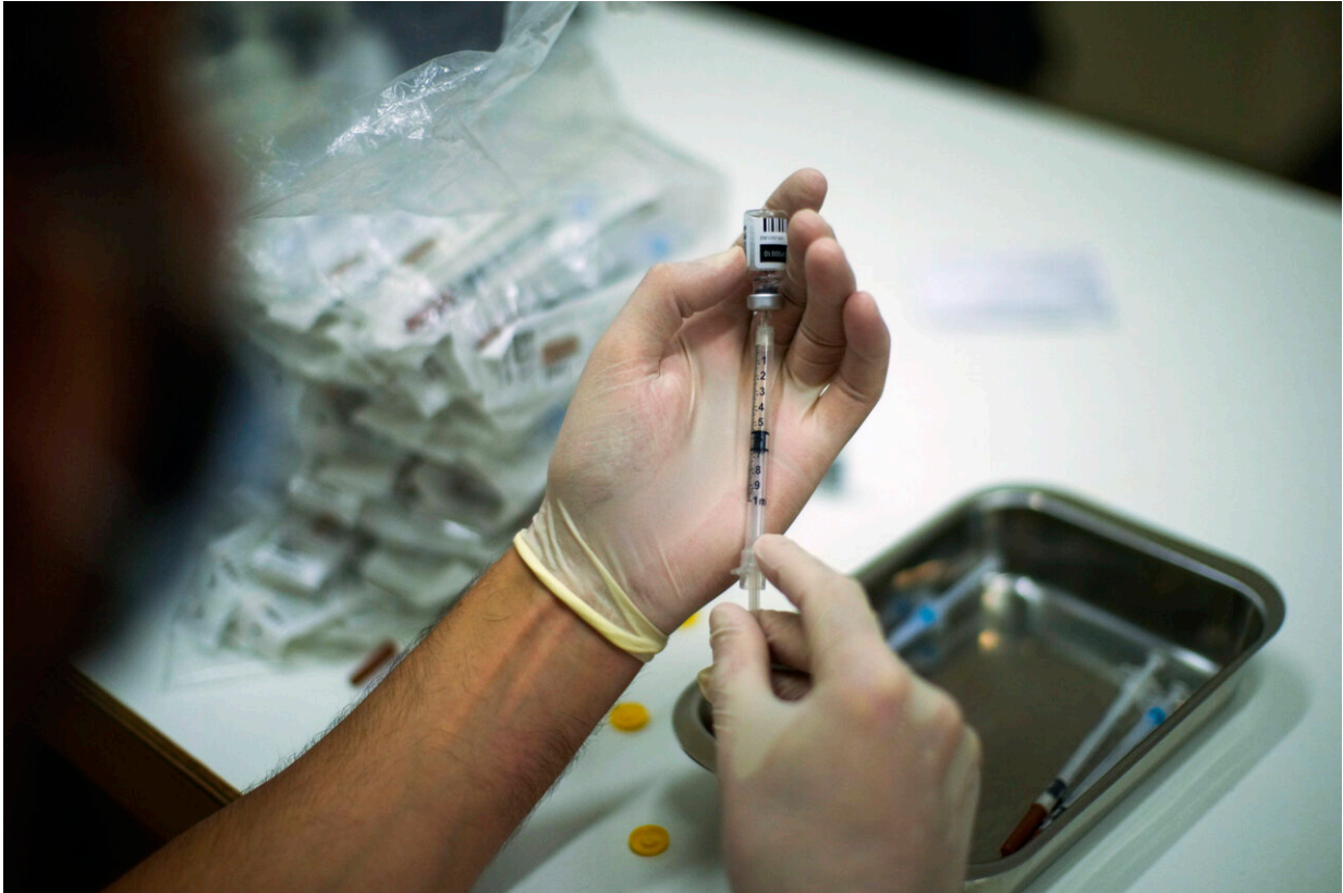
A health professional prepares syringes with vaccines against Monkeypox at a medical center in Barcelona, Spain, Tuesday, July 26, 2022.