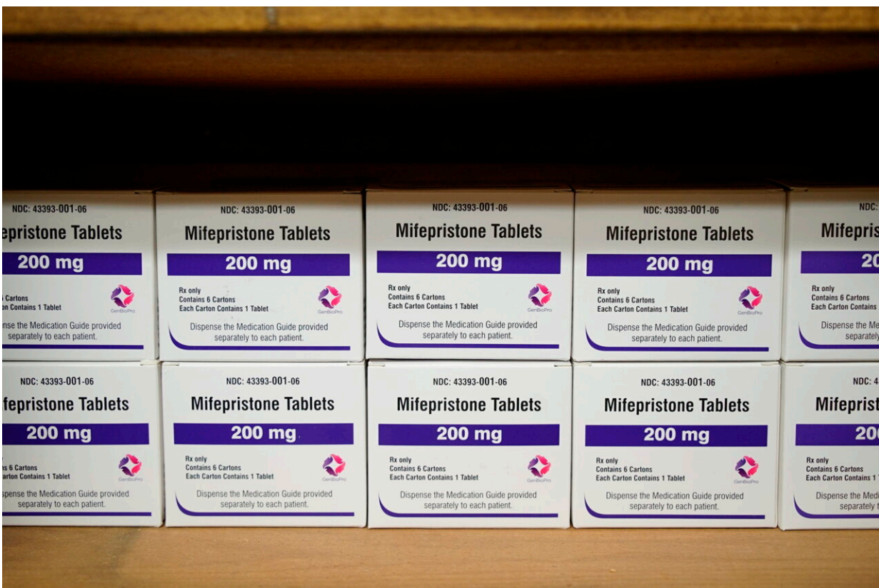
Boxes of the drug mifepristone line a shelf at the West Alabama Women's

Mifepristone is sold under the brand name Mifeprex and misoprostol under the brand name Cytotec, but both pills are available as generics.