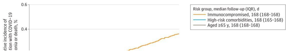
B Vaccination and booster with mRNA-1273 in high-risk subgroups

24-Week Cumulative Incidence of Hospitalization With COVID-19 Pneumonia or Death Following Vaccination and Booster.