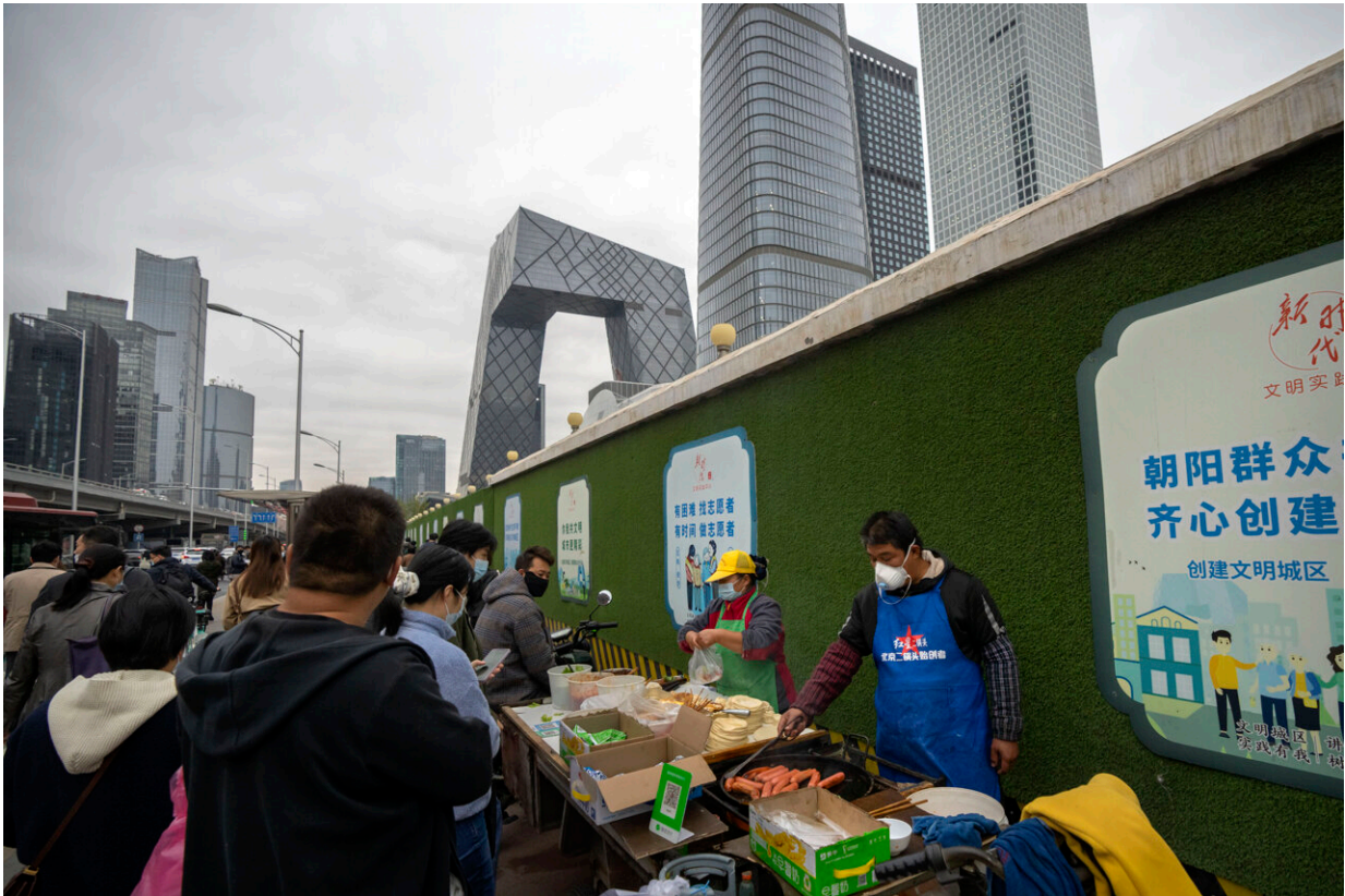
Street vendors wearing face masks make takeaway food for commuters at a cart in the central business district in Beijing, Friday, Oct. 28, 2022.

Still, China wants more people to get booster shots before it relaxes its restrictions. As of mid-October, 90% of Chinese were fully vaccinated and 57% had received a booster shot.