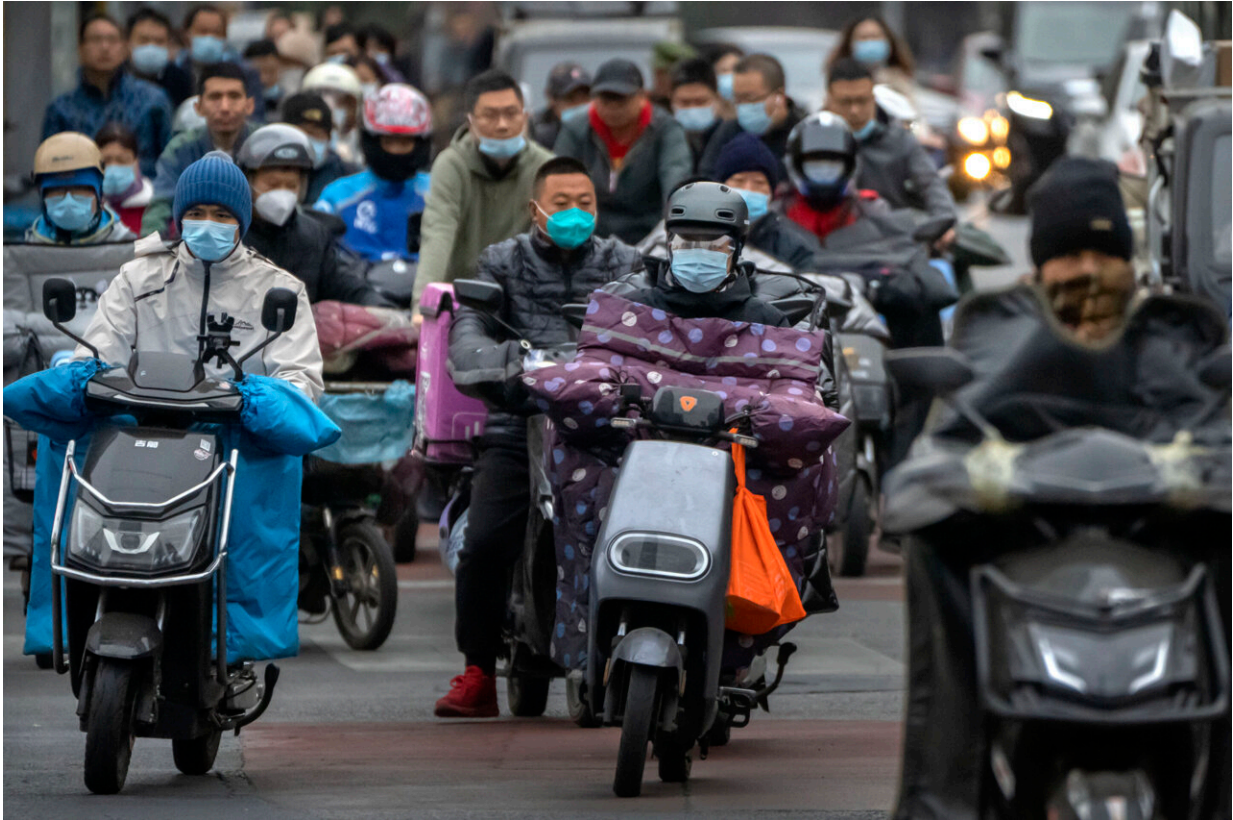
Commuters wearing face masks ride scooters along a street in the central business district in Beijing, Friday, Oct. 28, 2022.

Lhasa has been under tight surveillance since bloody anti-government protests broke out in the city in 2008 before spreading across Tibetan areas.