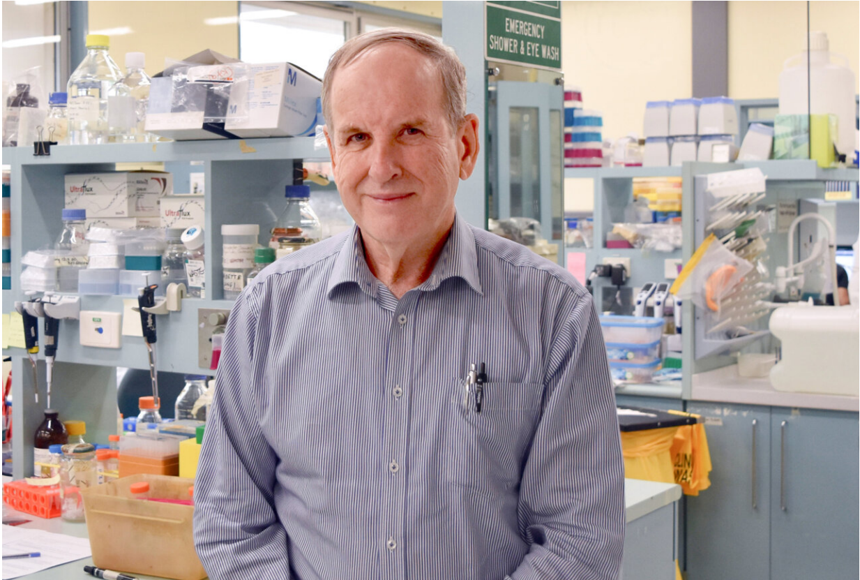
Professor Warwick Britton AO, Centenary Institute.

In the mice study, the new vaccine was delivered nasally, making its way through the respiratory tract , adhering to the tissues of the nasal cavity, airways and lungs. Testing showed the generation of high levels of protective antibodies in the airways and increased T-cell responses in the lungs (T-cells help destroy SARS-CoV-2 infected cells). Significantly, none of the vaccinated mice became infected with COVID-19.