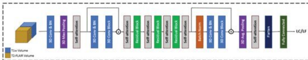
(c) 3D Residual Network with Self-Attention