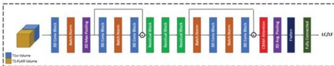
(b) 3D Residual Network with CBAM Attention