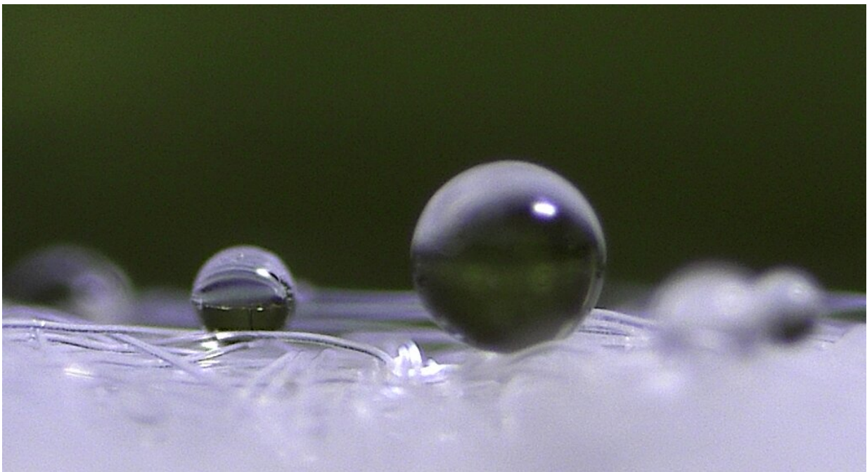
An optical image showing the large water droplets (1-5 mm in diameter) deposited on the microfibers of an N95 type mask.

Prior research has shown that over several hours, an N95 face mask can become less effective due to buildup of moisture from the breath of the person wearing it. This makes it more difficult for air to pass through, resulting in increased pressure inside the mask.