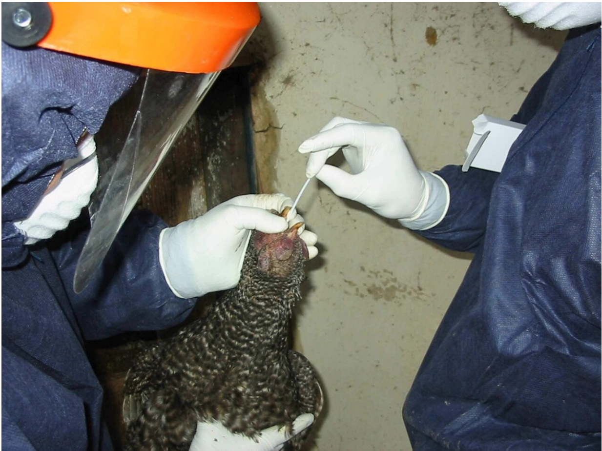
Testing poultry for avian influenza in Romania.

"It's just a numbers game. Viruses jumping species is not a rare event, so it's likely a virus will eventually make that final jump to humans."