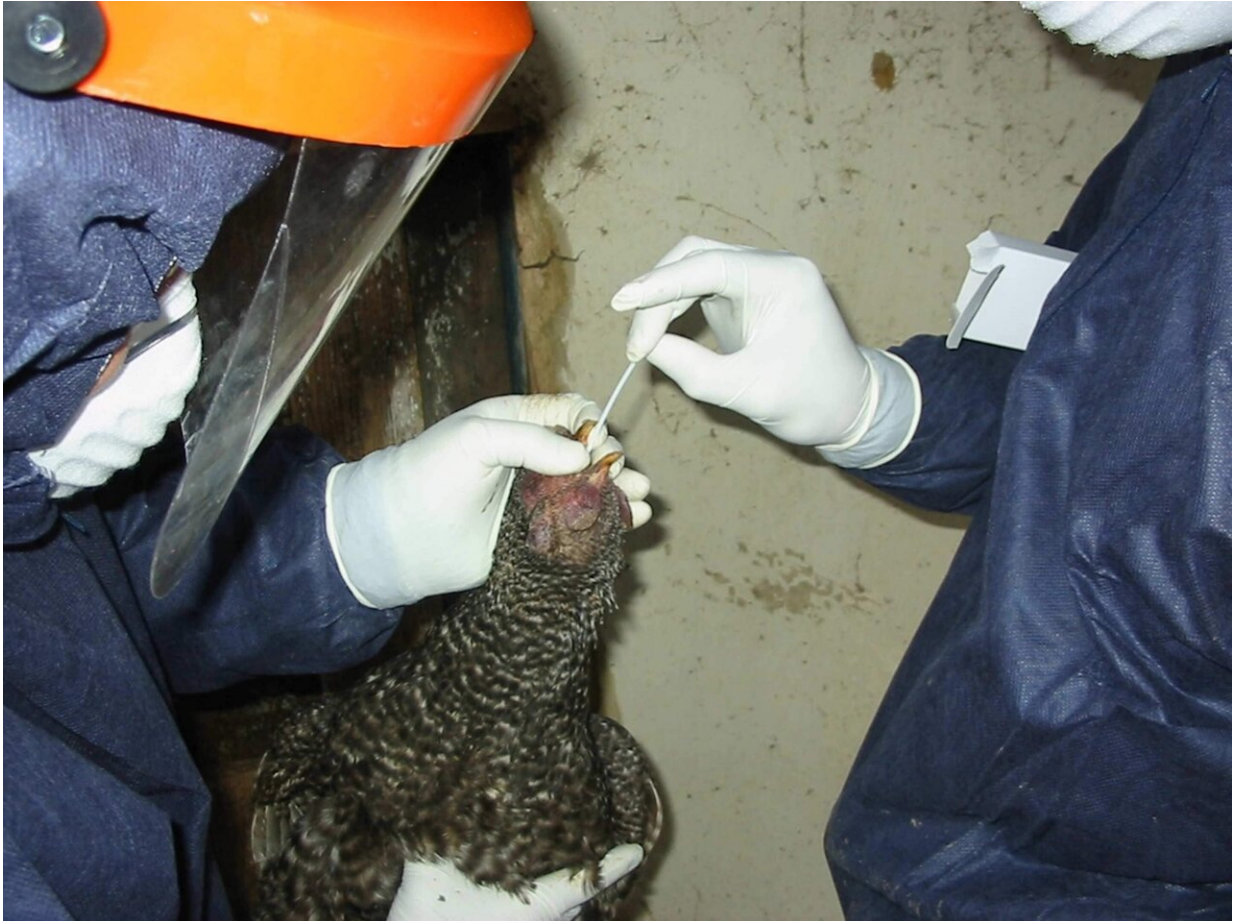
Testing poultry for avian influenza in Romania.

"It's just a numbers game. Viruses jumping species is not a rare event, so it's likely a virus will eventually make that final jump to humans."