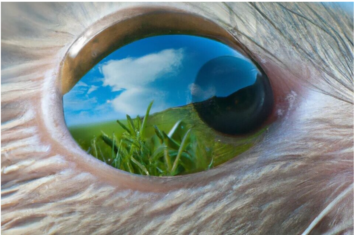
Illustration of natural statistics on the mouse eye. Credit: Divyansh Gupta, OpenAI DALL-E 2.

Existing neuroscientific models of the visual system suggest that it