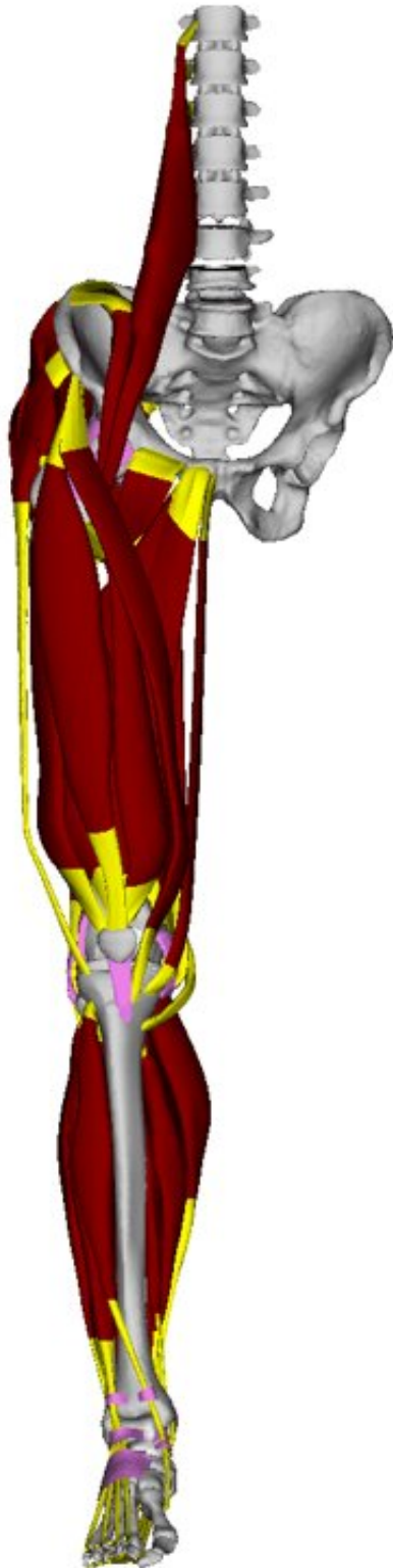
Human modeling of a leg.