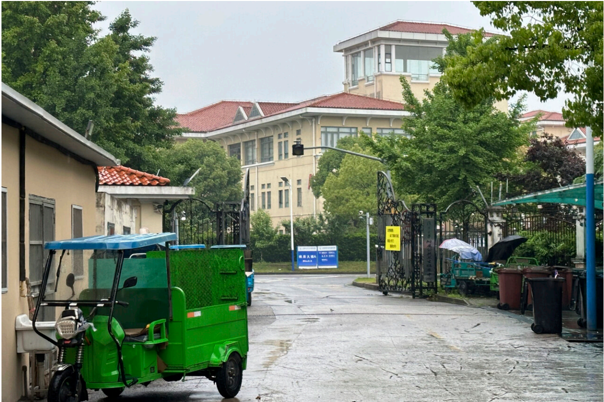
Buildings in the Shanghai Public Health Clinical Center stand near the entrance of the compound in Shanghai, China Tuesday, April 30, 2024. Zhang Yongzhen, the first scientist to publish a sequence of the COVID-19 virus, staged a sit-in protest after authorities locked him out of his lab at the center.