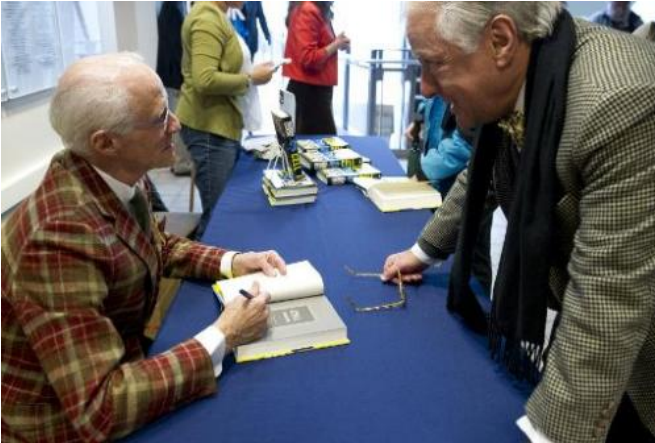
Author Robin Cook signs copies of his new book "Cell" at the Woodrow Wilson Center in Washington, DC on February 19, 2014

It's just in fiction for now, but the "avatar doctor," a virtual physician which consults and diagnoses through a smartphone app, is coming, says the author of a new medical thriller.