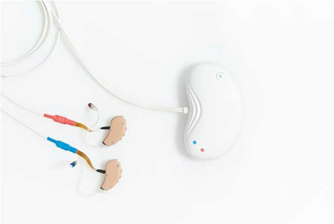
The Incus connected to hearing aids.