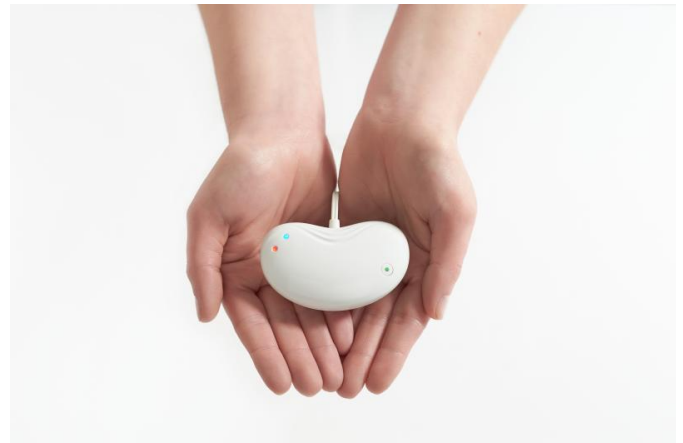
Ergonomic Incus.

"Modern hearing aids are almost invisible in daily use. Now we're removing as many as the other barriers as possible such as cost, usability and accessibility," says co-inventor Professor Peter Blamey.