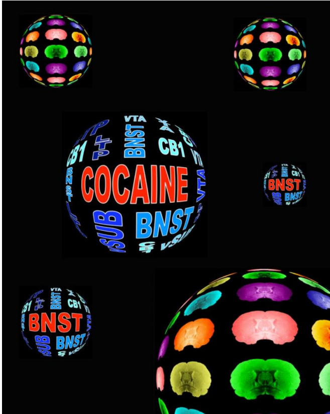
Artwork based on the characterization of the brain network underlying the hyperactivity of dopamine-producing neurons and the behavioral effects of cocaine. Credit: François Georges, PhD, Bordeaux University

The burst of energy and hyperactivity that comes with a cocaine high is a rather accurate reflection of what's going on in the brain of its users, finds a study published November 25 in Cell Reports . Through experiments conducted in rats exposed to cocaine, the researchers mapped out the network of circuits that cause wild firing of neurons that produce dopamine, a neurotransmitter that regulates movement and emotion. The findings also help explain how cocaine use eventually leads to desensitization.