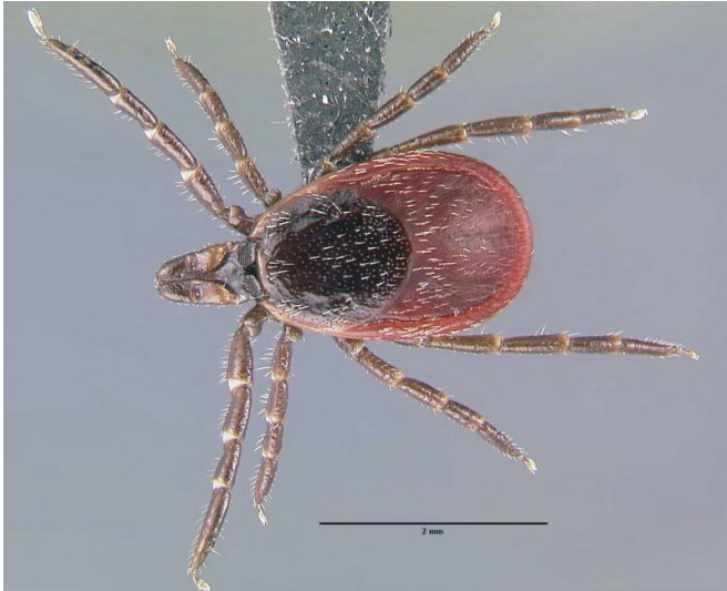
A blacklegged tick ( Ixodes scapularis ), one of the main vectors of Lyme disease.

Lyme disease is transmitted by the blacklegged tick ( Ixodes scapularis ) and the western blacklegged tick ( Ixodes pacificus ), and the range of these ticks is spreading, according to research published in the Journal of Medical Entomology .