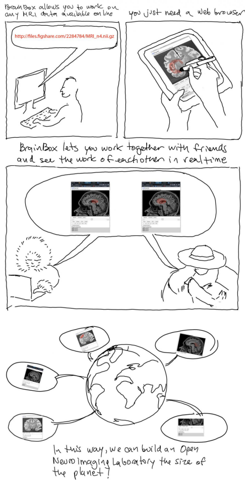
Cartoon showing the idea of distributed collaboration on Magnetic Resonance Imaging (MRI) data. Credit: Franka Barba

Despite the abundance of digital neuroimaging data, shared thanks to all funding, data collection, and processing efforts, but also the goodwill of thousands of participants, its analysis is still falling behind. As a result, the insight into both mental