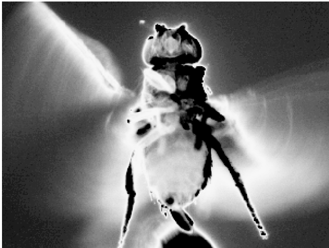
A fly navigating in a virtual flight simulator.

Pleasant and unpleasant odors are a part of everyone's life, but how do our reactions to smells change when other odors are present? To answer this question, researchers at the RIKEN Brain Science Institute in Japan have combined experimental and modeling approaches to reveal the process through which smell preference is computed in the brain. Published in Neuron , the work shows how the activity of neurons in the olfactory processing center of the Drosophila brain can be decoded to predict behavioral responses to odors, and reveals that the relative preference of odors can flip depending on the situation.