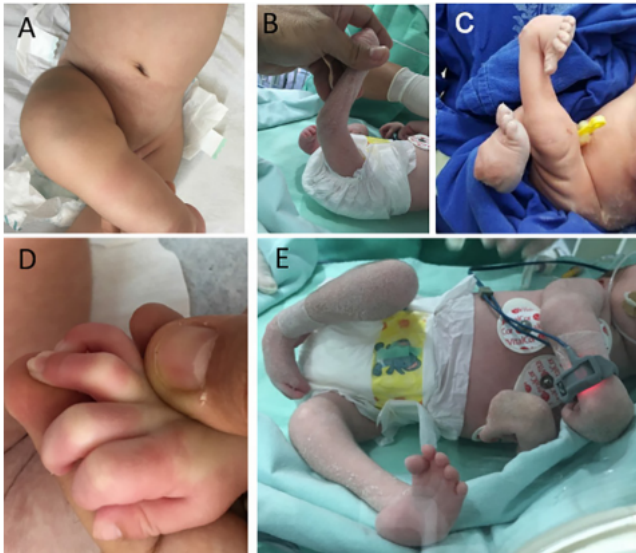
Clinical pictures of children with arthrogryposis.

A study published by The BMJ today provides more details of an association between Zika virus infection in the womb and a condition known as arthrogryposis, which causes joint deformities at birth, particularly in the arms and legs.