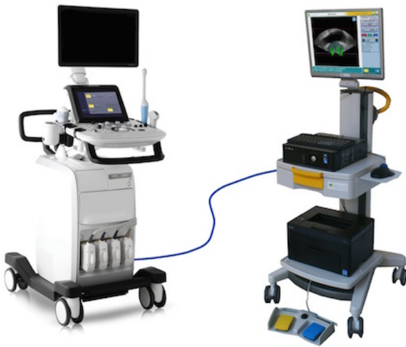
A fusion biopsy device (right) connected to an ultrasound machine (left) allows for visualization of suspicious areas detected with MRI during the ultrasound-guided biopsy of the prostate.

It works like this: after the urologist identifies a patient at risk for prostate cancer, radiologists use a state-of-the-art MRI examination to identify potentially suspicious areas. If present, the MRI images are then sent to a device that blends those with an ultrasound used by urologists to take a biopsy or sample of the tissue in question to determine whether it has cancer.