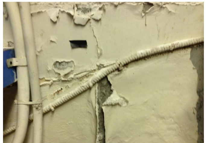
A previous study by Brown researchers and RI-based organizations studied compliance with the lead hazard mitigation laws.

The authors found that by third grade, test scores rose for all children in the study, regardless of demographic group, while the fraction scoring substantially below proficient declined. The greatest gains, the researchers found, were made by the children who were most affected by the certificate program.