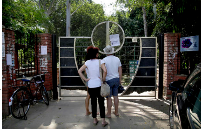
Visitors read closure notice pasted on to the entry gate of the Deer park in New Delhi, India, Friday, Oct. 21, 2016. City authorities have closed a sprawling park in the heart of New Delhi after eight birds died of suspected bird flu, days after the city zoo was closed to the public after nine birds died there.

Meanwhile, 15 storks have died over the past three days in a zoo in the central Indian city of Gwalior. Zoo official Pradeep Srivastava said zoo authorities were waiting for the autopsy reports on the painted storks to determine if avian influenza was present before deciding whether or not to shut the zoo.