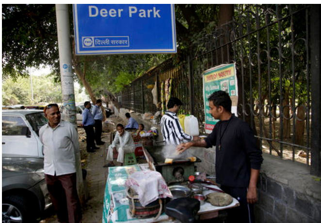
A roadside fast-food vendor tends to his business near the closed entry gates of the Deer park in New Delhi, India, Friday, Oct. 21, 2016. City authorities have closed a sprawling park in the heart of New Delhi after eight birds died of suspected bird flu, days after the city zoo was closed to the public after nine birds died there.