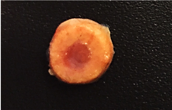
Engineered bone with functional marrow.

Engineers at the University of California San Diego have developed biomimetic bone tissues that could one day provide new bone marrow for patients needing transplants.