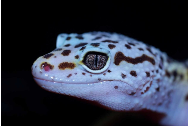
Leopard gecko.

A University of Guelph researcher is the first to discover the type of stem cell that is behind the gecko's ability to re-grow its tail, a finding that has implications for spinal cord treatment in humans.