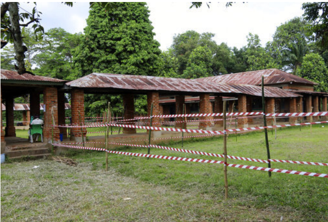
In this photo taken on Sunday, May 13, 2018, a health care worker wears virus protective gear at a treatment center in Bikoro Democratic Republic of Congo. Congo's latest Ebola outbreak has spread to a city of more than 1 million people, a worrying shift as the deadly virus risks traveling more easily in densely populated areas. Two suspected cases of hemorrhagic fever were reported in the Wangata health zones that include Mbandaka, the capital of northwestern Equateur province. The city is about 150 kilometers (93 miles) from Bikoro, the rural area where the outbreak was announced last week, said Congo's Health Minister Oly Ilunga.